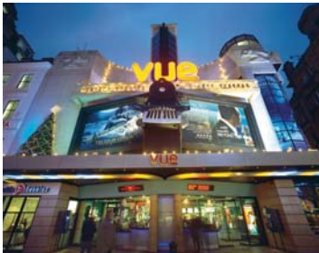
The mixed-use development will be anchored by a Vue multiplex

Terrace Hill has secured an agreement with VUE Entertainment to operate the cinema, and is in discussions with Whitbread which is interested in operating an 80-room Premier Inn hotel and Brewers Fayre restaurant.