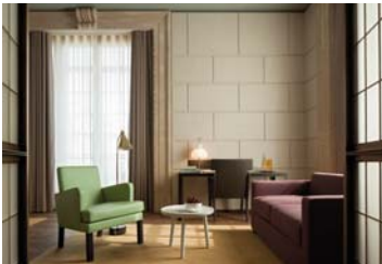
The iconic hotel has been designed by David Chipperfield Architects

The centre houses a large lap pool and four different areas, corresponding to the four elements: water (spa), fire (gym), air (yoga) and earth (organic bar). The spa offers a variety of Watsu hydro-experiences, a hammam and signature Akasha treatments.