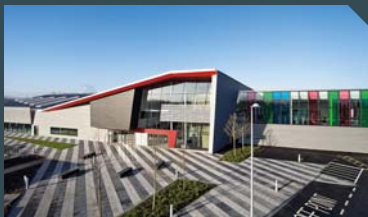
The Peak, Stirling Sports Village

DELIVERING INTELLIGENT SOLUTIONS FOR 30 YEARS