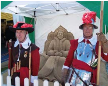
The Brighton sculpture park is scheduled to open for summer 2013