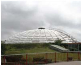
The Oasis Leisure Centre is the proposed location