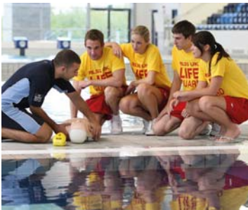
RAPs will look to create a single qualification framework for the sector