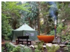
The all-weather spa is located in woodlands

"Our oldest member so far is 80," she says. "For now we are just advertising locally, but will be marketing it as a destination as well as targeting the corporate market." Details: http://lei.sr?a=X6H9Y