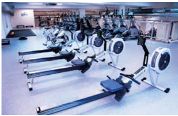
Gym Group and Travelodge will look to find development sites together