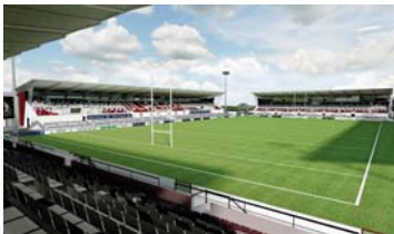
The Ravenhill venue is set to benefit from a complete redevelopment

The new Memorial End stand will provide covered seating for approximately 2,400 people with terracing for a further 1,350 fans. It will