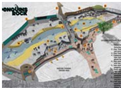
An artist's impression of the new Penguin Rock