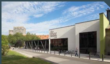
The Edge, University of Leeds

S&P works with you to deliver inspirational environments by solving your procurement demands and establishing new models of service consolidation and partnership working