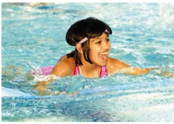
Facilities at Southgate Leisure Centre include a 25m swimming pool

The leisure centre features an eco-friendly roof on the newly-built section of the centre. The 'living roof' will be planted with grass and plants to reduce the amount of rainwater that goes to drainage.