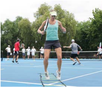
Cardio tennis group sessions can be held both indoors and outdoors

According to the LTA, more than 8,500 people already take part in weekly cardio tennis events at 500 venues in the UK.