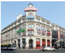
The Printworks property at the heart of Manchester

Land Securities has the largest commercial property portfolio in the UK, managing