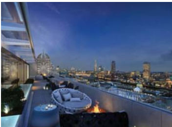
ME London is located near Covent Garden in the heart of the capital

The Marconi Bar and the rooftop Radio Bar also form part of ME London, which joins other ME properties in the Spanish cities of Madrid and Barcelona and Cabo and Cancun in Mexico. Other facilities include a fitness area