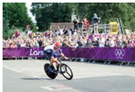
The events will cover a range of different sports

GES will be funded by National Lottery money and the government will work in partnership with UK Sport to support national governing bodies through the process of hosting games. UK Sport will also work closely with national and regional partners, including the