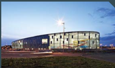
Cardiff International Pool