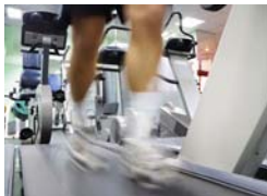
Improvements will include a new 50-station gym

The current leisure centre will remain in operation until the new facility opens in 2015. Details: http://lei.sr?a=S5E3N