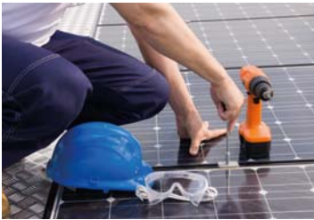
Since installation, the PV panels have generated more than £16,000

Since the installation of the panels in March 2012, the two centres have combined to generate more than £16,000 from Feed In Tariffs - the government's scheme for paying PV users for feeding power back into the grid. In the six months since their installation the Downs Leisure Centre's panels have created 23,000kw of energy, with Lewes producing 49,000kw. In total this has contributed to a reduction of 66 tonnes in CO2