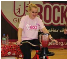
The female-only scheme is expanding its reach

The scheme will run until 2015 and will be rolled out across 15 locations, each containing two clubs. The locations are Liverpool, Manchester, Walsall, Wigan, Newcastle, Hastings, Birmingham, Chorley,