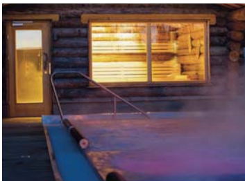
Facilities include a sauna built using traditional Finnish kelo timber

A signature feature of Y Spa is one of the UK's first authentic Finnish kelo saunas (made using traditional timber), a standalone outdoor cabin which has been constructed using 100-year-old imported kelo logs.