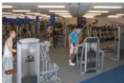
Exercise4Less has seven gyms in the north of England

Construction is currently underway and the council estimates that the project will be completed in late 2013. Details: http://lei.sr?a=7g6t8