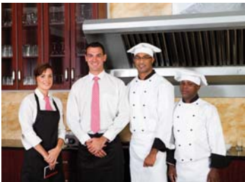
The new apprenticeships will be based on the Level 4 Diploma courses

People 1st led the development of the new framework and, working in partnership with UH Ventures and University College Birmingham, has gained funding