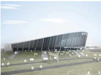
The arena will have a competition standard velodrome and sports courts

Designed in partnership by Mace and FaulknerBrowns Architects, the arena will be built on the site of an existing park and ride facility and it is due for completion in early 2014. Bowmer and Kirkland have been appointed as contractors for the project. A groundbreaking ceremony was held on 22 November to mark the start of work on the new arena, after Sport