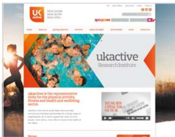
A website and branding have been created to support the new identity

"We'll achieve this by facilitating big impact partnerships, championing innovation,