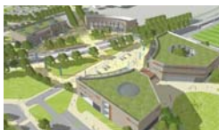
An artist's impression of the campus plans