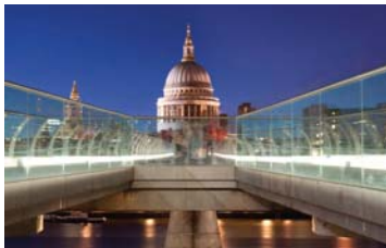
The campaigns aim to increase domestic tourism during 2013

They will form phase two of a three-year investment project called 'Growing Tourism Locally'. Funded by £19.8m from the RGF, the project aims to generate £365m in additional tourism spend over the three-year period and inspire more Britons to take more holidays at