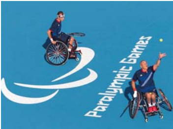
The profile of disabled sport has benefited from the 2012 Paralympics

Clubs across the UK where disabled people play sport will also be able to join in the Sainsbury's Active Kids scheme, benefiting from free equipment and experiences through voucher collection. The number of disabled people playing sport at least once a week has increased by 160,000 over the past year and