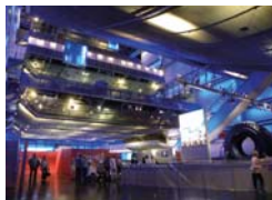
The programme includes a number of free events

providing high quality services to members, campaigning, providing research and sharing insights. This is our promise to our members, stakeholders and the nation. We exist to serve any organisation with a role in, or benefit to be gained from, getting more people, more active, more often." Details: http://lei.sr?a=H9B7z