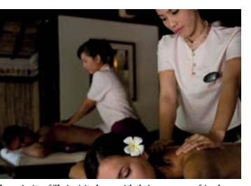
The majority of Thais visited spas with their spouse or a friend

"The Thai spa industry has never had any spa consumer statisitics, being reliant on assumptions and guestimations. Now for the first time