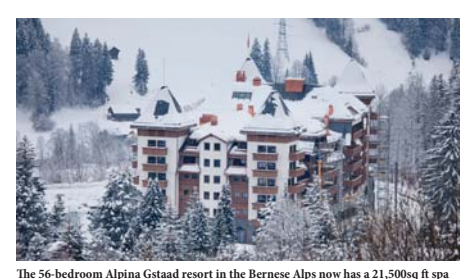
n Alpina Gstaad resort in the Bernese Alps now has a 21,500sq π spa

The spa has 12 treatment rooms, comprising both single and couples' treatment areas including a flotation room, a hammam, a colonics room, an ayurveda room, a cave room and a salt room.