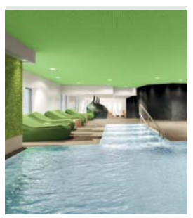
Schletterer was responsible for the spa planning

There is also a contemporary interpretation of the Lägenfelder Badl tradition, with double hot tubs filled with original thermal water