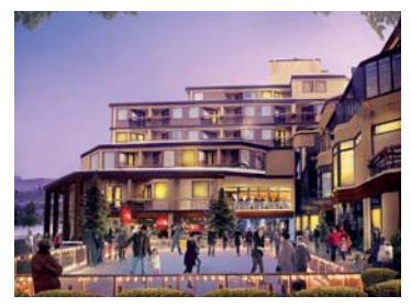
The resort is a joint partnership between Starwood and Wasserman

Dining options include The Snowmass Kitchen, an all-day restaurant with ski-in/skiout access. The resort also features a Westin Workout fitness centre as well as two hot tubs,