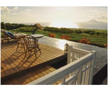
Accommodation\ will\ be\ offered\ in\ 90\ one-bedroom\ cottages\ with\ pools

The second phase will feature a 20,000sq ft (1,858sq m) destination spa managed by Sedona Resorts and designed by Bill Bensley. There will also be fine dining restaurants, a golf clubhouse, a beach house, outdoor hot tubs and more villas.