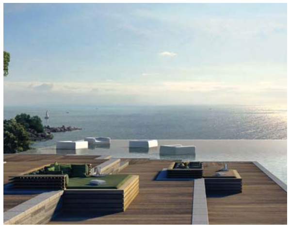
The spa is designed to be one of Alila's most comprehensive

The four-hectare (10-acre) village is designed to celebrate Asia's arts and cultural