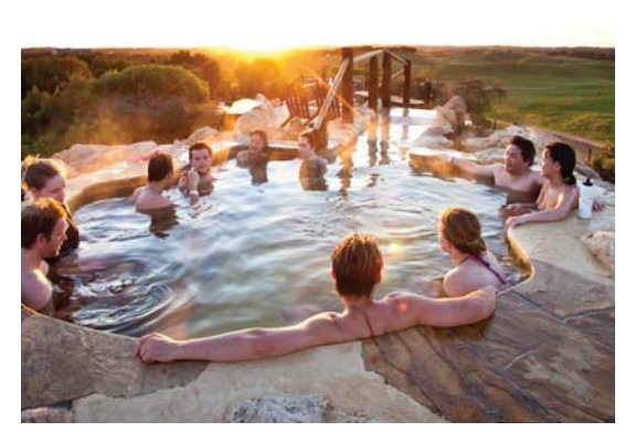
Peninsula Hot Springs is a Friend of Mental Health Australia

The new relationship also helps Mental Health Australia in its work to encourage businesses to recognise and assist with mental health issues in the workplace. Peninsula Hot Springs CEO and co-founder