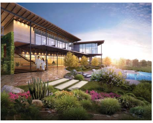
Loma de Vida Spa & Wellness will use indigenous Texas elements

"The architecture and design of the spa creates intentional spaces that are