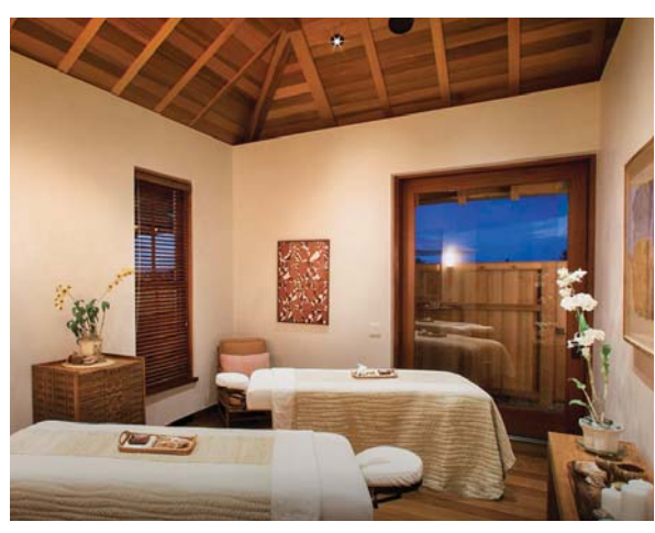
The spa design will use natural materials and make use of breezes

"Hawaii is a treasure chest of natural ingredients from both the land and the ever-generous ocean," said Lee. "With Aloha Aina as our guide, we make use of organic ingredients that are created with both potency and efficacy in mind, and always with a respect for our precious earth."