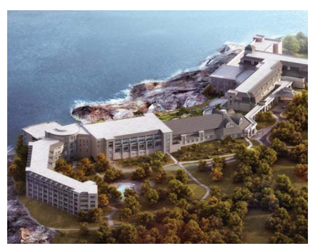
The spa will have an emphasis on Maine's 'wild and free' elements

The spa will also include a Sun Lounge - a pre- and post-treatment lounge where guests can interact, reflect and unwind. The lounge features diverse seating zones and is expansive enough to offer guests a connection between indoors and outdoors with natural light, terrace seating and fire elements.