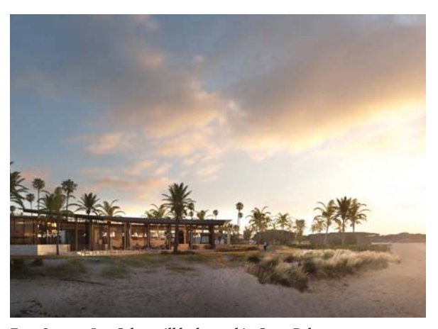
Four Seasons Los Cabos will be located in Costa Palmas

The modern design is a collaboration between California-based architects Vita Inc.,