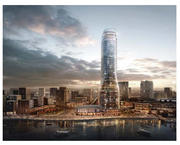
The Kula Belgrade will be the centerpiece of a waterfront development

The wider waterfront development, one of the largest in Europe, is designed as a "modern city within the city" to reinvigorate Belgrade, which was significantly damaged during the Kosovo