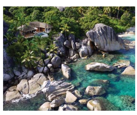
The spa will be built along the dramtic boulders

With contemporary architecture and the integration of sustainable processes and technologies, the spa is designed to become an integral part of the island's ecosystem, and to