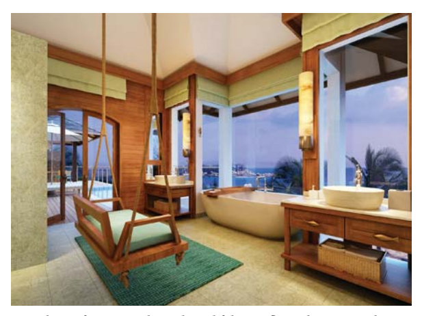
An palette of stone, timber, tile and fabric reflects the surroundings

The 28 one-bedroom pool villas and two two-bedroom pool villas all have private