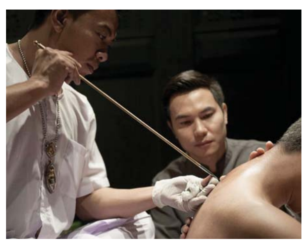
Sak Yant are a traditional form of tattooing with geometric symbols

The 2,000-year-old tradition, which is thought to have originated in ancient Cambodia, has seen it designs grow in popularity throughout South East