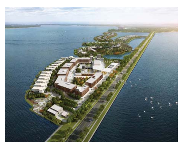
Sangha is being built along Yangcheng Lake outside of Suzhou

wellbeing, including an integrated medicine assessment and treatment centre, mind-body practice, coaching, counselling, spa, medispa and mindful dining. Adjacent to the wellbeing hotel will be a village quarter that houses an education and learning complex, designed for group learning experiences. The retreat will include a 6,000sq m (64,583sq ft) spa with treatments from massages to colonics, as well as a 1,200sq m (12,917sq ft) hammam, wet spa, steam room and saunas.