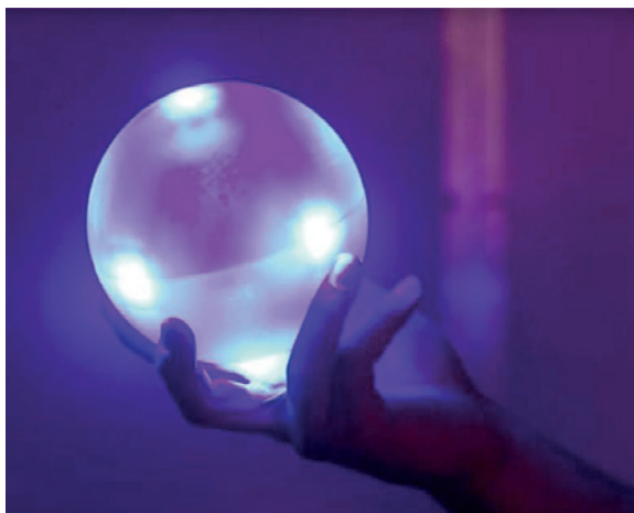
The system uses a form of static energy to safely charge the air

“Wireless power delivery has the potential to seamlessly power our electrical devices as easily as data is transmitted through the air,” said a statement from Disney Research.