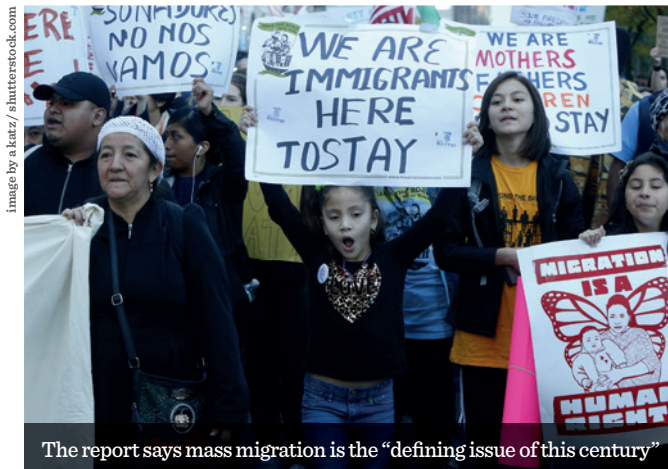
The report says mass migration is the "defining issue of this century"

"Museums' communities are being buffeted by the economic, cultural and political fallout from current inequities in the