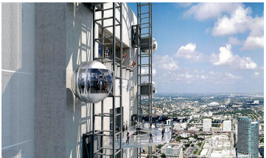
The observation pods will climb as high as 1,000ft, offering one-of-a-kind views of Miami

All other elements of the tower, which is being developed by Berkowitz Development Group, were approved in December, with a separate application made for Skyrise on 28 February. Other attractions will include the Sky Plunge bungee jumping experience, SkyDrop freefall drop tower, a 'flying' theatre simulator and a number of