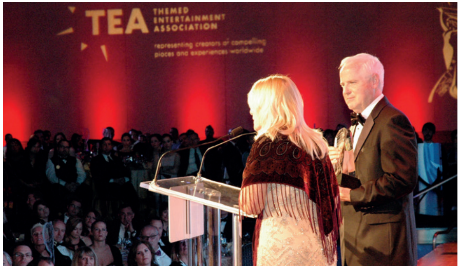
The Thea Awards Gala presentation recognises the very best in the attractions sector

The two-day event provides IAAPA members based in the United States with the opportunity to meet with influential