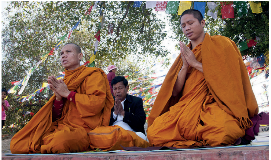
Lumbini became a World Heritage site in 1997 and is popular among spiritual tourists

The ISC meeting laid out a 12-point plan, starting with the recommendation that Heritage Impact Assessment should be conducted before approving any new development within the Greater Lumbini area. On that same line, any new masterplan created for Lumbini or the surrounding area should consider the government and UN-approved development plan.