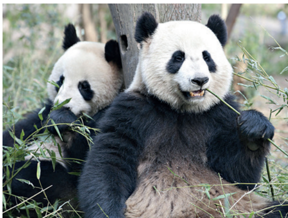
China's panda population has grown 16.5 per cent in a decade

Efforts by the Chinese government over the last decade has seen the number