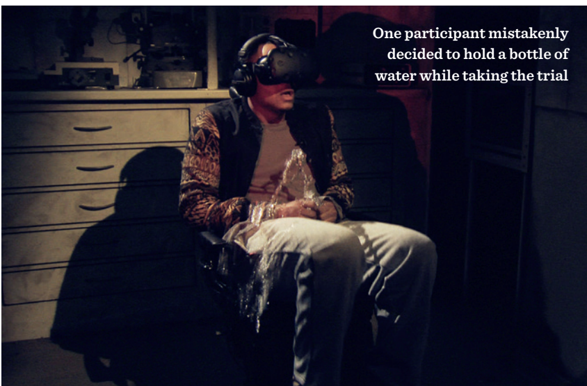
One participant mistakenly decided to hold a bottle of water while taking the trial

"Derren is so clever in what he does and how he works. With this ride you question reality itself because it does play with your mind. When you get off Rise of the Demon, you'll think to yourself 'what actually happened?' It's brilliant."