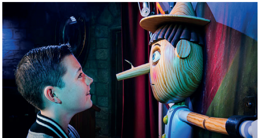
Shrek's Adventure London is an immersive, actor-led 90-minute experience

AM2 is published fortnightly by The Leisure Media Company Limited, Portmill House, Portmill Lane, Hitchin, Herts SG5 1DJ, UK and is distributed in the USA by SPP, 75 Aberdeen Road, Emigsville, PA 17318-0437. Periodicals postage paid @ Manchester, PA POSTMASTER Send US address changes to Spa Opportunities, c/o PO Box 437, Emigsville, PA 17318-0437. The views expressed in print are those of the author and do not necessarily represent those of the publisher The Leisure Media Company Limited. All rights reserved. No part of this publication may be reproduced, stored in a retrieval system or transmitted in any form or by means, electronic, mechanical, photocopying, recorded or otherwise without the prior permission of the copyright holder. Printed by Preview Cromatic Ltd. ©Cybertrek Ltd 2016 ISSN Print: 2055-8171 Digital: 2055-818X