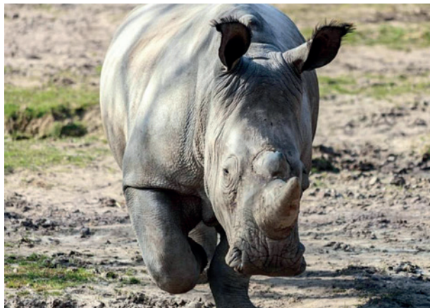
Poachers killed the captive rhino in Thoiry Zoo for its horn