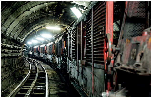
Syx's ReCreateX software will be installed at retain points