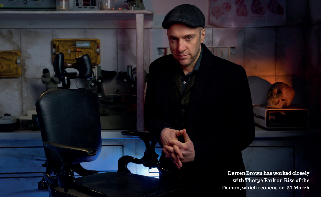
Derren Brown has worked closely with Thorpe Park on Rise of the Demon, which reopens on 31 March