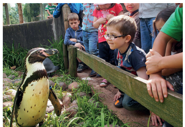
Zoo inspectors found 'significant problems' in multiple areas

According to a report on conditions at the attraction, zoo inspectors found "significant