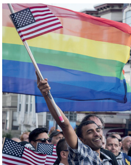
AAM says museums must lead by example

"Museums and cultural institutions strive to provide places where people of every background can safely come together to learn and share from each other's common yet diverse cultural, natural, and social experiences," said a statement from the body. "We find it difficult to imagine how educational institutions could aspire to anything less."