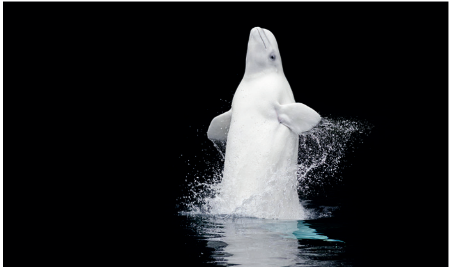
The aquarium's two on-display belugas suddenly died in November last year

Following two nights of debate over the matter, councillors voted to “bring forward for enactment by the Board an amendment to the Parks Control bylaw to prohibit the importation and display of live cetaceans in Vancouver parks.” The amendment for enactment will be issued by 15 May 2017.