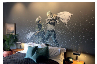
Banksy works feature throughout