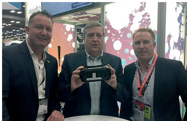
Digisoft built the experience platform, with the VR headset

It will explore the American Revolution and will feature a collection of Revolutionary-era weapons, personal items, letters, diaries, and art.