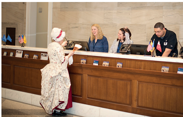
Gateway provided full ticketing solutions for the attraction

Quest for Legoland allows players to unlock themed missions, play car games, answer trivia questions and learn about landmarks they pass. The app has 40 games in total and features contextual trivia on thousands of landmarks, including several landmarks.