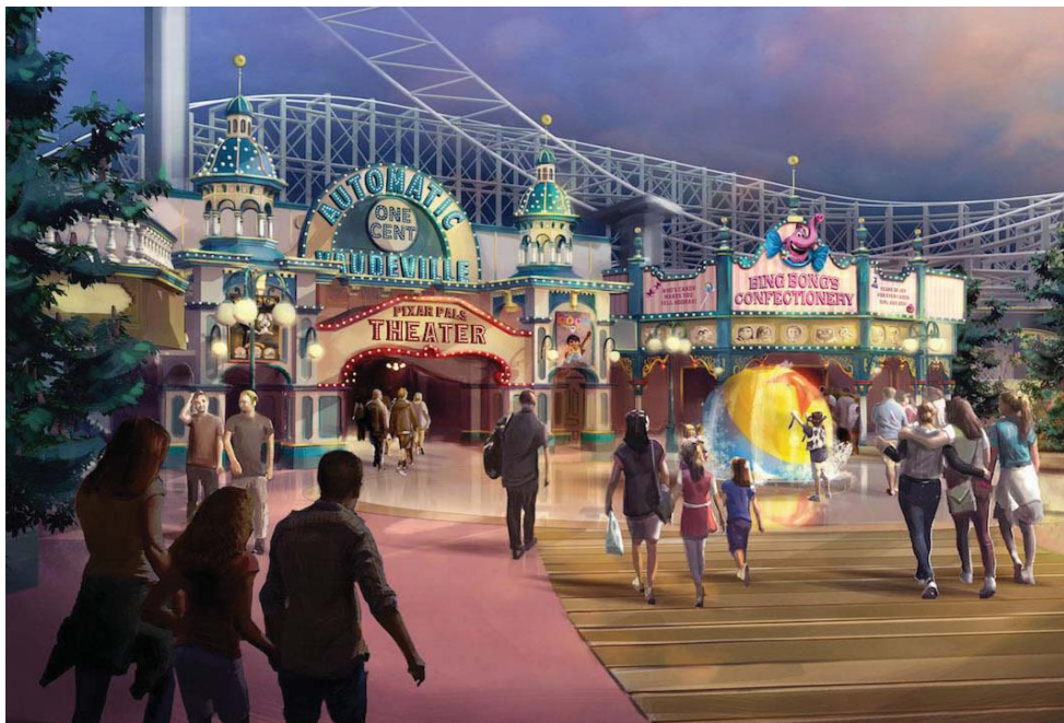
Pixar Pier was one of several announcements made by Disney for its parks during D23 in 2017