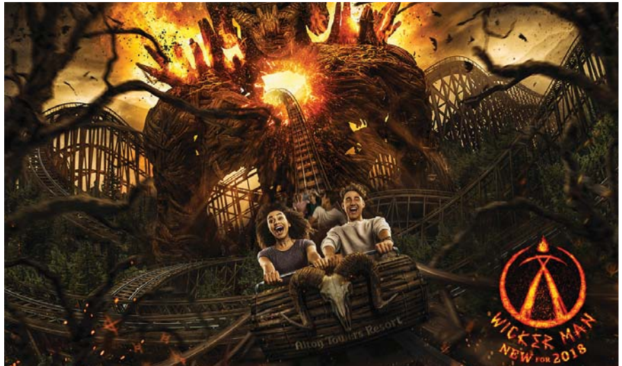
The wicker man will burst into flames as riders race through the flaming structure three times

Then called 'SW8' or 'Secret Weapon 8', a design and access statement submitted by Nathaniel Lichfield & Partners said the coaster