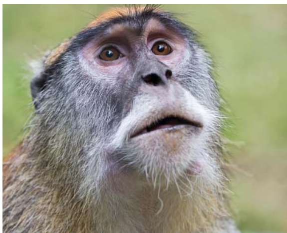
The deadly blaze started in the patas monkey house

The park remains open to the public but the jungle enclosure will remain