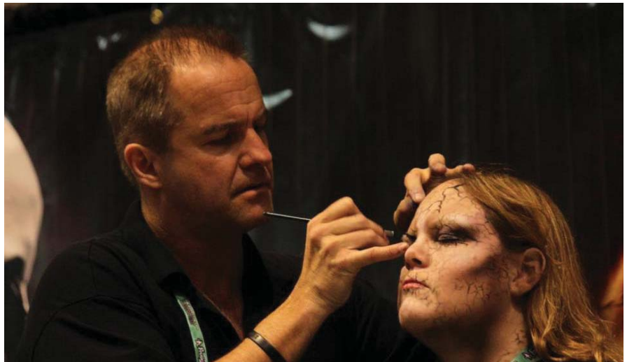
HAuNTcon brings together members of the haunted attractions sector

The only specialised trade event of the amusement industry in Turkey and the region, ATRAX offers an effective business platform for buyers. The conference will bring together people to discuss the major issues in the sector and develop a strategic road map for the sector. Tel: +90 212 570 63 05 Email: tureks@tureksfuar.com.tr www.atraxexpo.com/en