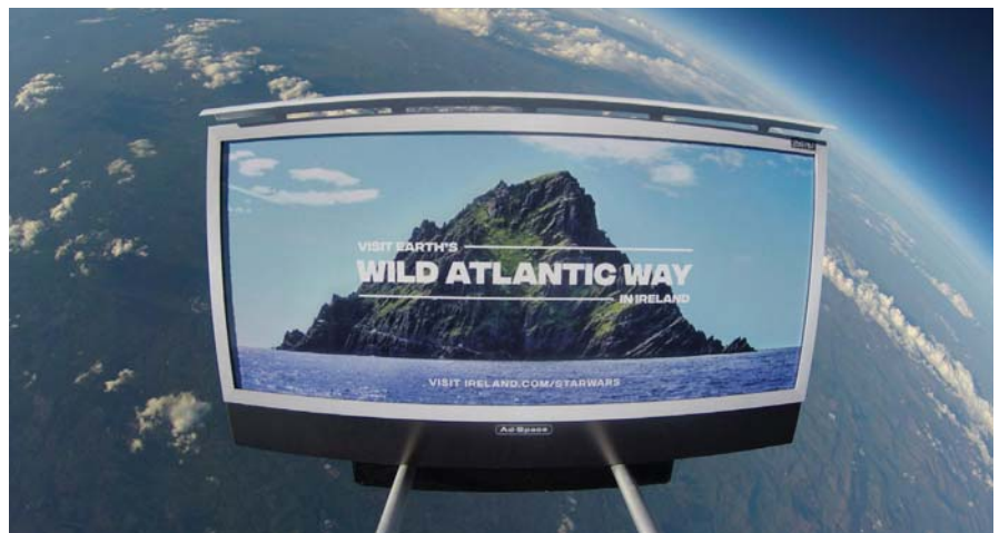
The sign for Ireland's latest tourism campaign travelled into space via weather balloon

AM2 is published fortnightly by The Leisure Media Company Limited, Portmill House, Portmill Lane, Hitchin, Herts SG5 1DJ, UK and is distributed in the USA by SPP, 75 Aberdeen Road, Emigsville, PA 17318-0437. Periodicals postage paid @ Manchester, PA POSTMASTER Send US address changes to Spa Opportunities, c/o PO Box 437, Emigsville, PA 17318-0437. The views expressed in print are those of the author and do not necessarily represent those of the publisher The Leisure Media Company Limited. All rights reserved. No part of this publication may be reproduced, stored in a retrieval system or transmitted in any form or by means, electronic, mechanical, photocopying, recorded or otherwise without the prior permission of the copyright holder. Printed by Preview Cromatic Ltd. ©Cybertrek Ltd 2017 ISSN Print: 2055-8171 Digital: 2055-818X