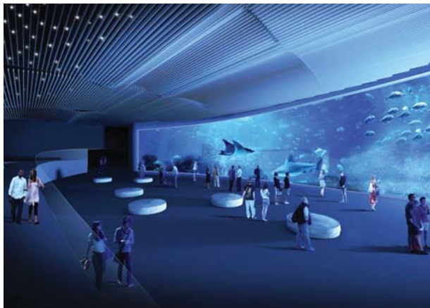
The aquarium has the world's largest curved window exposition

Featuring 38 display tanks and 350 species of fish, birds, small mammals, amphibians and reptiles, the 12,500sq m (134,500sq ft) venue has been masterplanned by Spanish architecture firm VDR Designs, with a focus on renewable energy and sustainability.