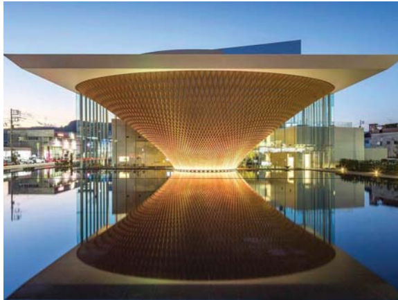
The facility is formed by an inverted latticed timber cone

Inside, exhibitions tell the story of the 3,776m (12,389ft) World Heritage site, the history of the Fuji-ko religion it inspired, and its role in popular culture. Facilities include a 4K theatre, a library, an event space, a