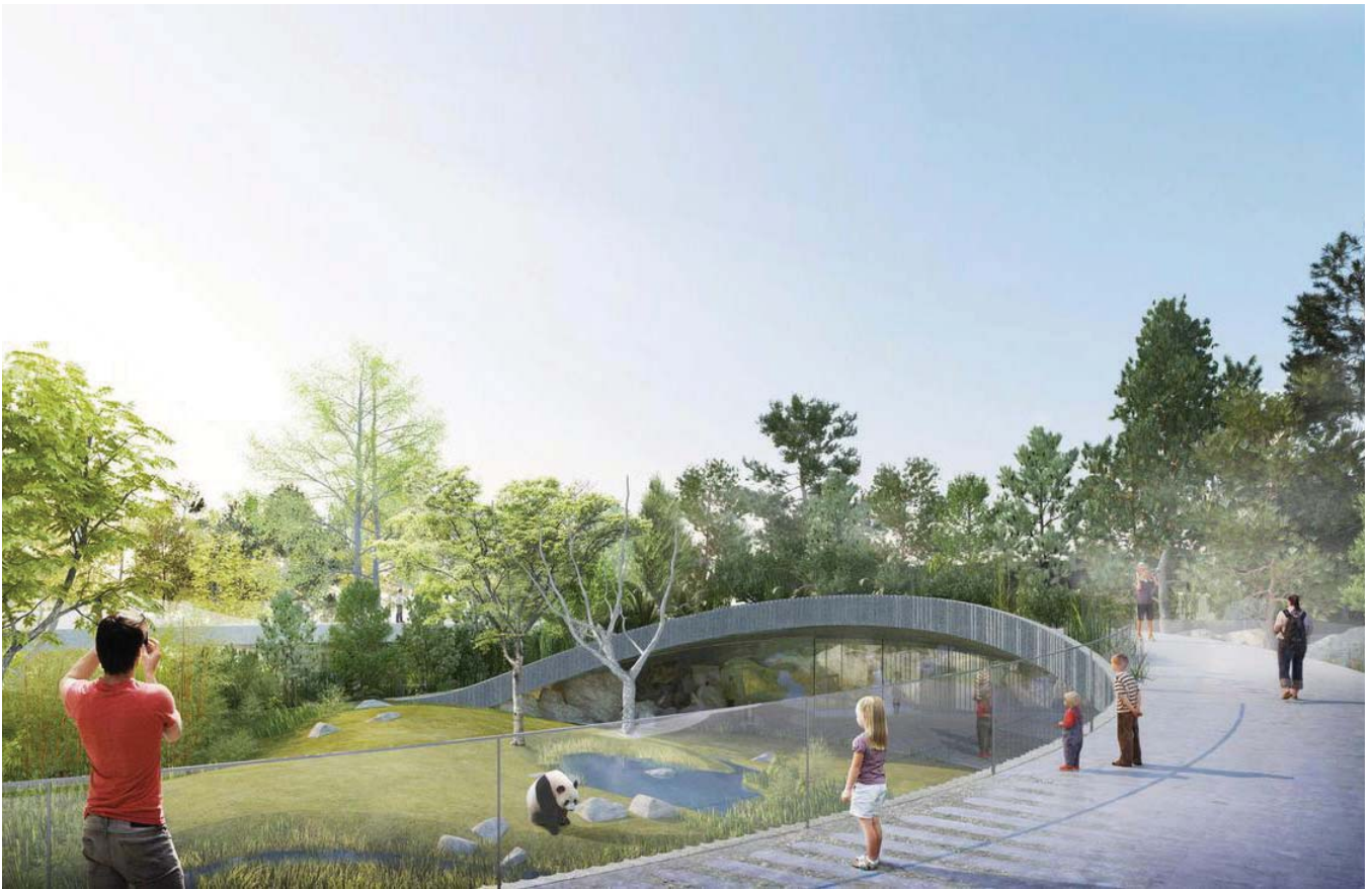
The circular shaped facility at Copenhagen Zoo is divided into two halves, one for the female and one for the male panda

into Gotham City, Metropolis, Looney Toons and Hanna-Barbera themed zones.