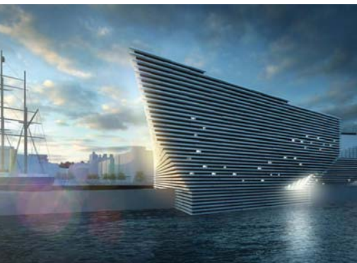
The V&A Dundee – Scotland's first design museum – is a sister to London's Victoria and Albert

Ingels and his design firm, BIG, are working on the design with landscape architects Schonherr. The team has designed an environment as close to the pandas' natural habitat as possible.