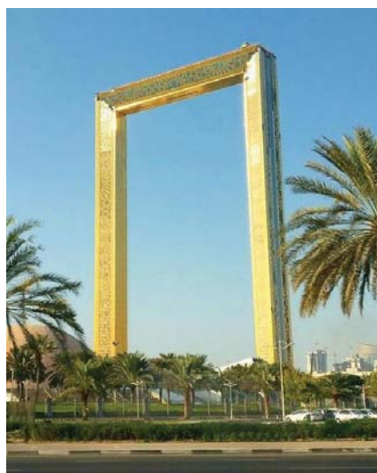
The Frame opened to the public this month

The AED160m (US$43.5m, €36.2m, £32.3m) project, called the Dubai Frame, was originally designed by Mexican architect Fernando Donis following an international competition in 2009 –