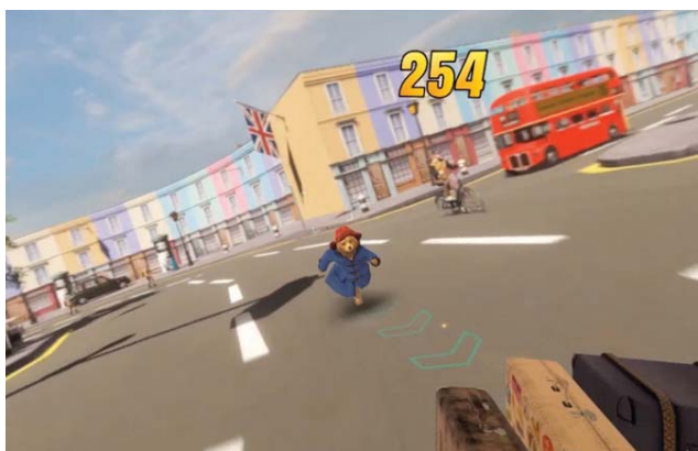
Riders can interact with Paddington by moving their heads