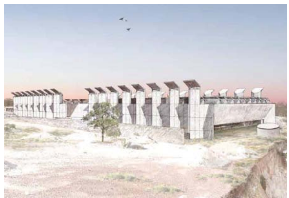
The Australian Opal Centre will be built in Lightning Ridge

The journey will then continue into the permanent exhibitions, education and learning facilities, a cinema, gallery