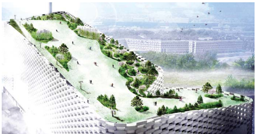
Multiple leisure activities will be incorporated into the rooftop scheme

"The project has been very challenging," said SLA partner Rasmus Astrup. "Not only because of the extreme natural – and unnatural – conditions of the site and the