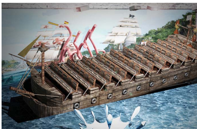
Pirates of Bacalar takes riders on a thrilling high seas adventure

Wearing VR headsets, riders race through London on a double decker bus, scoring points as they go. The ride features interactive elements that allow guests to interact with Paddington using head movements. MackMedia worked with Gameloft to develop the animation, which is an extension of the company's Paddington Run game.