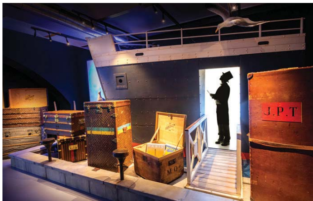
Visitors are given a glimpse into the 'Golden Age of Travel'