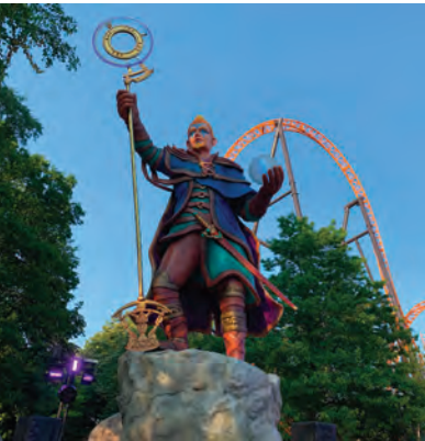
■ Land of Legends is based on a mystical, mythical world

B elgian theme park Bobbejaanland has opened a new themed area representing the park's largest-ever investment.