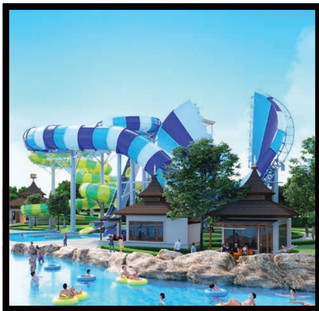
■ Angkor Water Park will have rides supplied by WhiteWater

{ "The waterpark is set over 60,000sq m and will alongside the zoo become an entertainment hub in the city" }