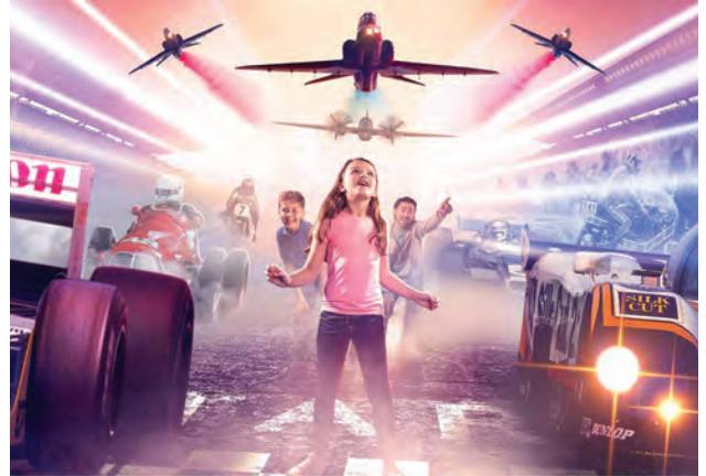
■ The opening has been pushed back until at least September