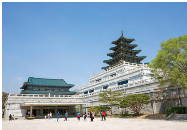
■ The country will have more than a thousand museums by 2023