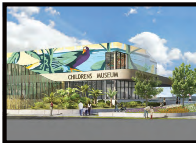
■ The proposed new facility in Bonnet Springs Park

Located at Bonnet Springs Park, a 180-acre park in downtown Lakeland marked with giant oak trees and a gurgling clear stream, the new Explorations V Museum will also conduct research to advance the understanding of how children learn, how families achieve together, and what Central Florida needs as it raises