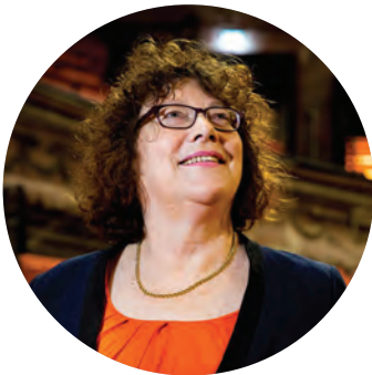
■ Ros Kerslake, CEO of The National Lottery Heritage Fund

New lottery fund offers £100m for major UK heritage projects