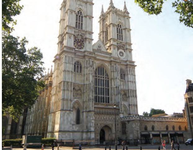
● Westminster Abbey collected visitor feedback from surveys

The Abbey has previously collected visitor feedback from on-site paper surveys and regularly monitors Trip Advisor reviews, however the new partnership will see the implementation of survey kiosks - located in the Abbey precincts, outside the Chapter