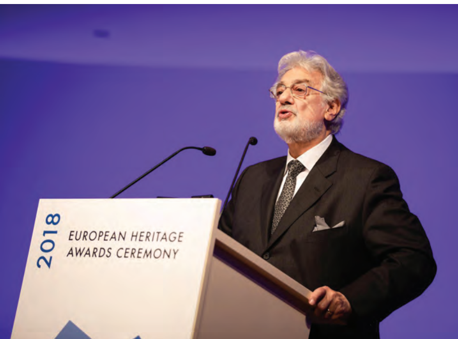
■ Spanish opera singer Plácido Domingo heads Europa Nostra

New EU agenda states the importance of cultural heritage