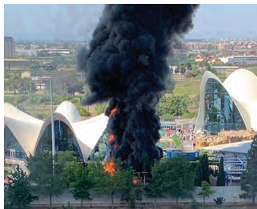
■ Thick black smoke was seen during the fire

A tweet from the aquarium said that the fire started near the entrance to the Oceans tower, which houses