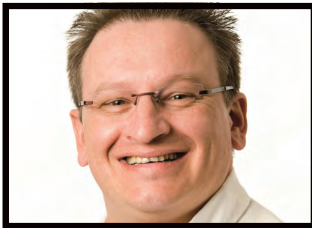
■ Gerbeau contributed to the development of Euro Disney

The news is coupled with the appointment of PY