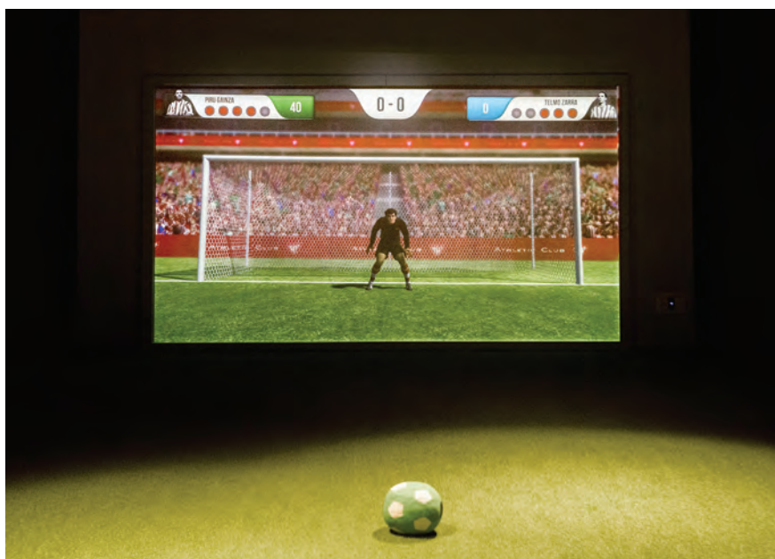
● 30 Christie projectors were installed at the San Mamés Stadium Museum in Bilbao, Spain