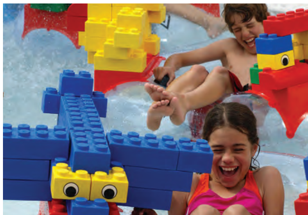
■ The waterpark is scheduled to open by the end of next year