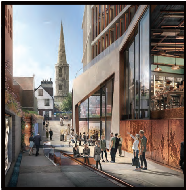
■ A planning application is to be submitted in the coming months

{ "This is an opportunity to understand York's origins and find out more about how the city developed" }