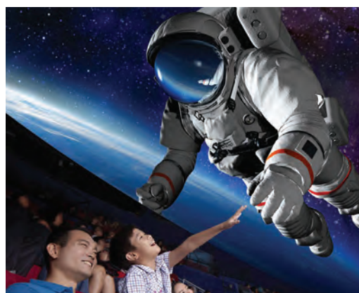
■ The attraction will present immersive learning

The attraction will be integrated with Jurong Lake Gardens and is envisaged