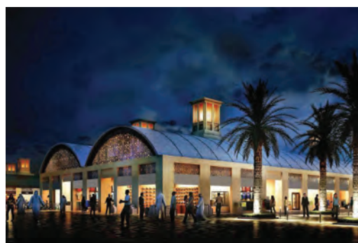
■ The Night Market will be the largest in the world

The zombie-themed entertainment zone will feature a variety of live acts, events, games and battles. Activities will include paintball, escape games, VR 9D cinema, a haunted house and maze, axe throwing, archery, laser tag, trampolines, target shooting, zombie apocalypse attack and zombie runs. Also included in the theme park experience