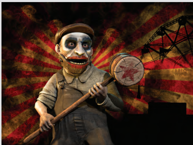
● Triotech's XD Dark Ride will take guests on an immersive adventure

the latest offering from Triotech Studios, which takes guests on a nightmareish immersive adventure with a disturbed clown seeking revenge. Visitors will find themselves trapped in a dilapidated