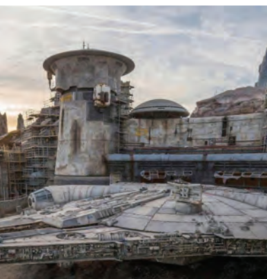
■ The new attraction is proving very popular among visitors

Disney's new Star Wars: Galaxy's Edge attraction at its Anaheim, California resort, has proved so popular since opening on 31 May that a virtual queuing system has been introduced to help manage crowds.