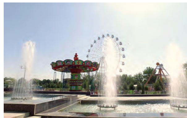
■ The incident occurred in the city of Jizzakh

"As a result of the crash of the 'Flying Saucer' attraction, a girl, born in 1999, died at the scene of the incident," said