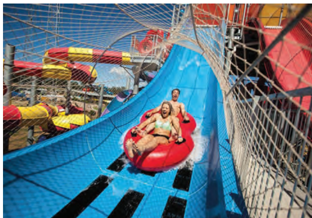
■ The Wet 'n' Wild waterpark in Sydney opened in 2013