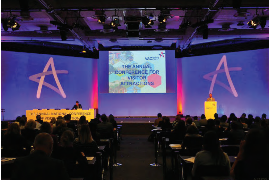
■ Now in its 16th year, VAC is the premium event for all types of visitor attractions

The Association of Science-Technology Centers (ASTC) Annual Conference provides an opportunity to display products and services to the largest