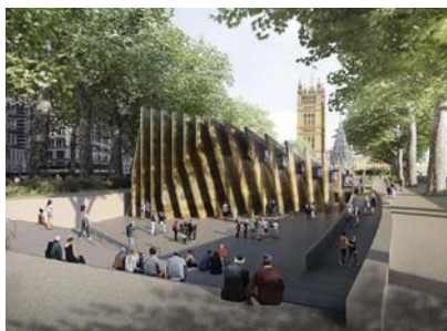
The joint proposal of Adjaye Associates and Ron Arad Architects is one of the designs displayed