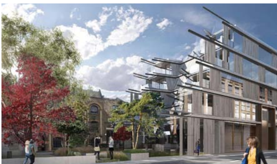
The hotel has five stories that are fractured into angular balconies