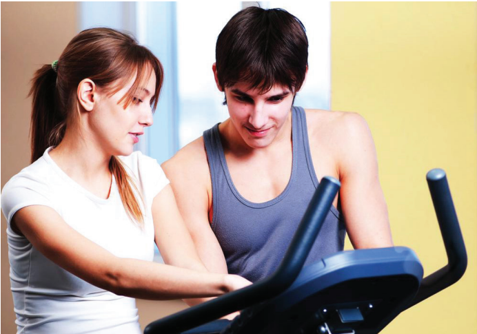
REPs was founded in 2002 as part of efforts to professionalise the fitness industry