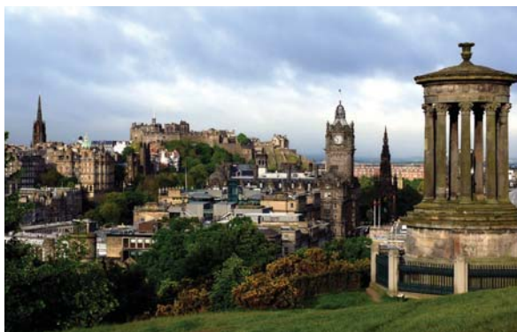
The concert hall will be built in St Andrew Square, close to Calton Hill

In addition to chamber music, the venue would also host jazz, folk, rock, pop, electronica and classical performances, as well as solo and song recitals and small dance ensembles.