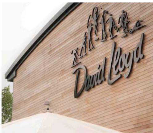
David Lloyd Kensington in London is due to reopen in June