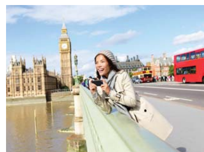
The value of UK tourism is estimated at £114bn