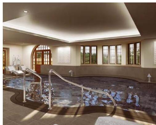
Wet areas include a 10m indoor hydro spa swimming pool

Elan Spa will feature an outdoor vitality pool with countryside views, glazed outdoor