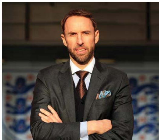
England manager and Football Foundation ambassador Gareth Southgate said the grants were 'vital' for creating of new teams

According to the Football Foundation – which is delivering the project – applications from these groups are "being encouraged". The application window opened on 1 February and closes on 29 March.