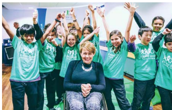
ukactive chair Tanni Grey-Thompson at the launch of the HASS tool

The launch of the free resource comes after the Royal College of Paediatrics and Child Health's State of Child Health report last week, which highlighted that 40 per cent of