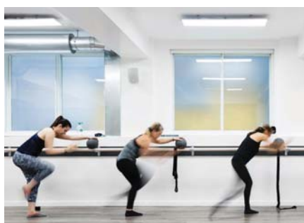
The 3,000sq ft club is a contemporary space for Xtend Barre’s ‘adrenaline-fuelled’ training classes