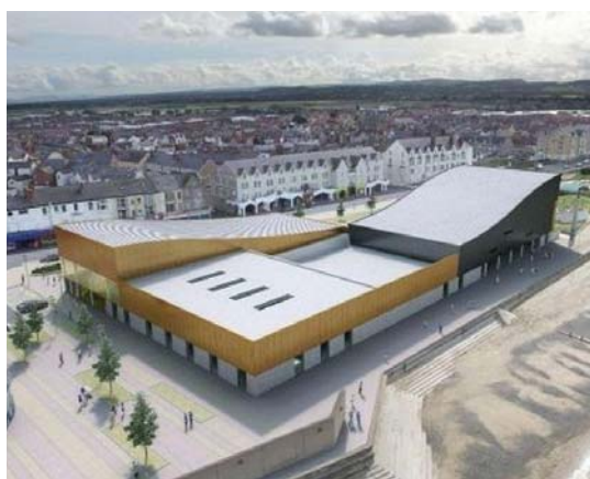
The park will attract an extra 350,000 visitors to Rhyl each year

The park, which will be open year-round, will offer outdoor options for the summer months, with a sun deck,