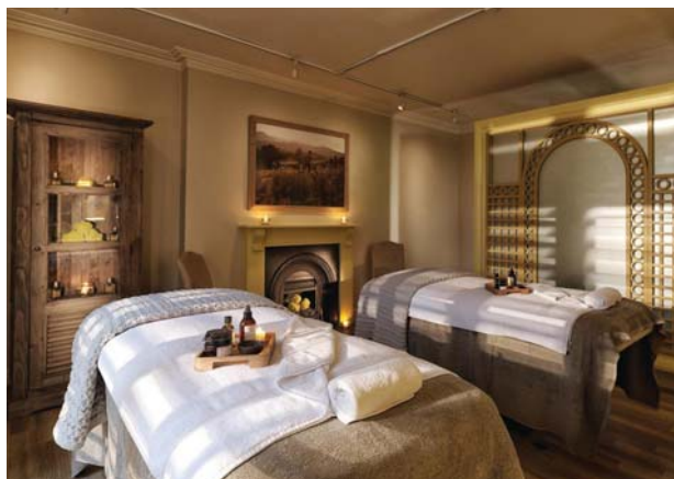
The spa offers advance body treatments and welcome rituals to guests

The signature treatment is the Verbena Relaxing Massage using Swedish effleurage,