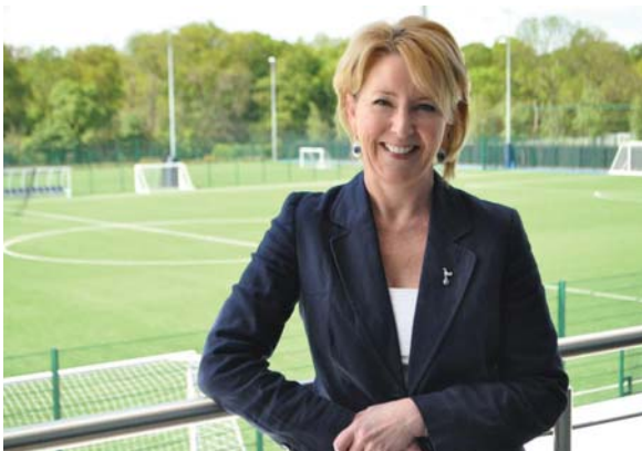
Cullen floated the idea of NFL and Premier League 'double-headers'

The stadium will also have an economic impact in terms of employment, with 3,700 new jobs supported, bringing in another £293m to the local economy.