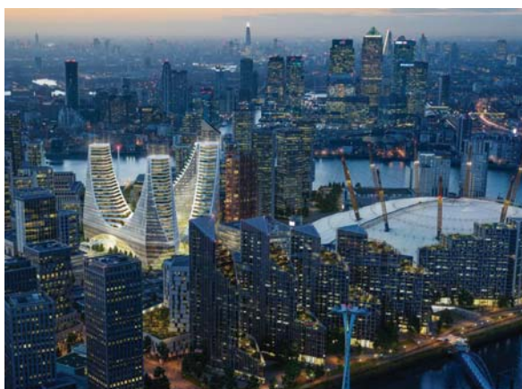
Calatrava unveiled a typically large-scale project for the capital

The heart of the project, though, is the 24m-tall glazed winter garden, which is the scene