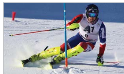
Ryding became the first Briton in 35 years to achieve second place in the race