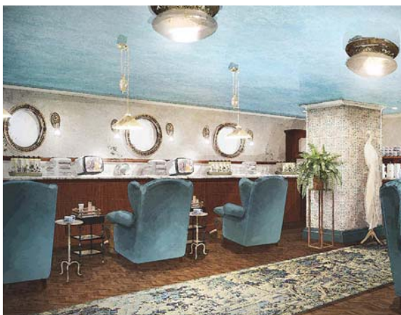
The hotel is being designed by Alice Lund and run by Soho House

The spa and grooming areas are open to the public and include three brand offerings: the subterranean Cowshed spa, which offers a range of treatments, including tailor-made massages, body wraps, manicures and pedicures and facials. There is also a Cheeky nail bar with 10 stations;