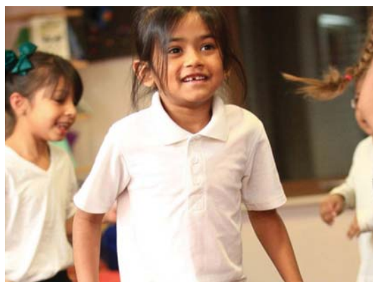
Children will be encouraged to move around during normal lessons