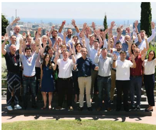
More than 30 individuals took part in Future Leaders 2016