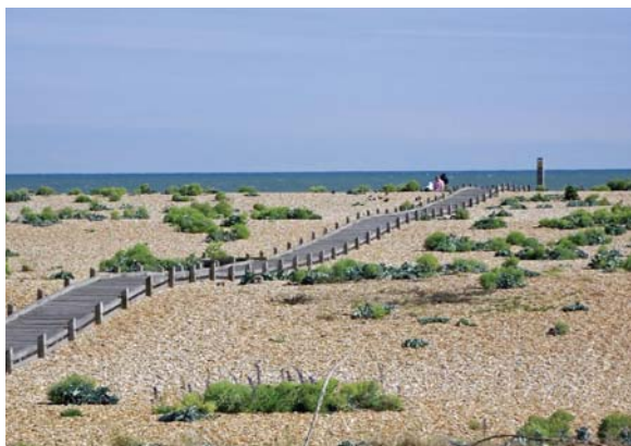
The Fifth Continent will restore and protect habitats on the Kent coast

Alongside restoration works, a programme of events and activities is lined up, including town tours, storytelling sessions, a Blue Plaque scheme and traditional skills workshops.