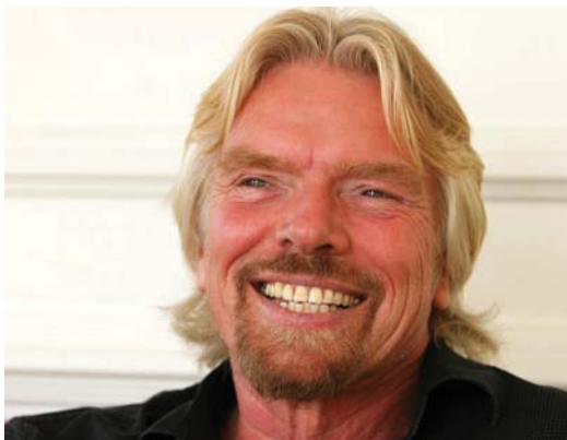
Sir Richard Branson will be taking part at the festivals

founder, said: "Sport is something that I try to make time for every day. Pushing past physical and mental expectations has been an important part of my life.