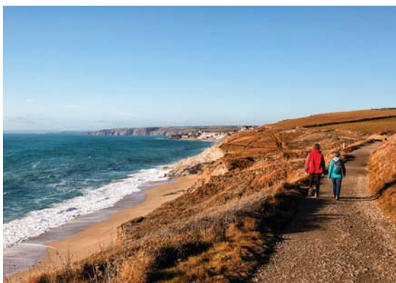
Tourists have been venturing outside of London in record numbers

For Scotland, overseas visitors spent £1.6bn during the period – a rise of 12 per cent. Visits also grew 4 per cent to 2.2 million.