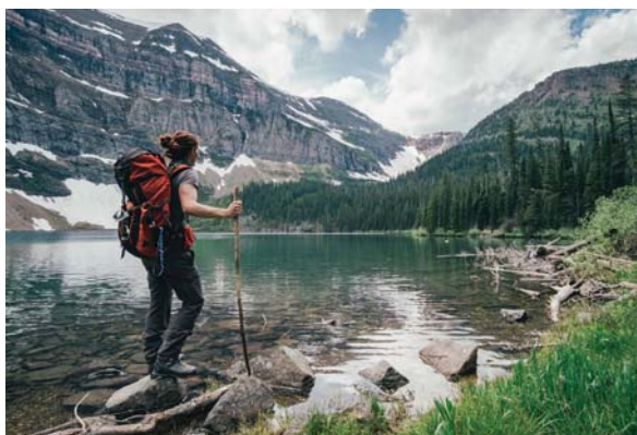
2017 has been designated the official year of sustainable tourism