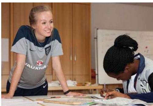
British 18-25 year-olds will be encouraged to take part