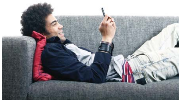
More than 11m people do less than 30 minutes physical activity per week

The quango has earmarked £250m over the next four years to getting the inactive active.