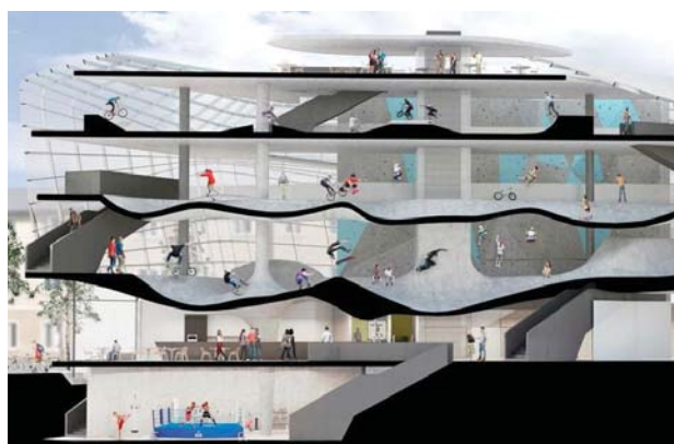
The multi-level skate park plan is thought to be the first of its kind

The site is on an old bingo hall which lies near the planned wider regeneration of Folkestone. Nearby is the creative quarter, home to other architecturally significant projects, such as the recently completed performing