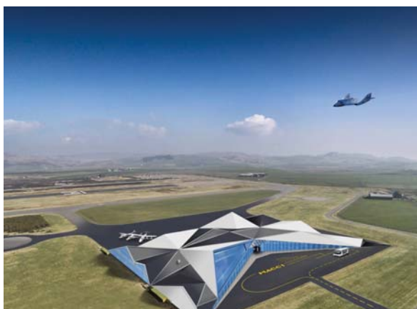
Artist's impression of how a Machrihanish Airbase spaceport might look