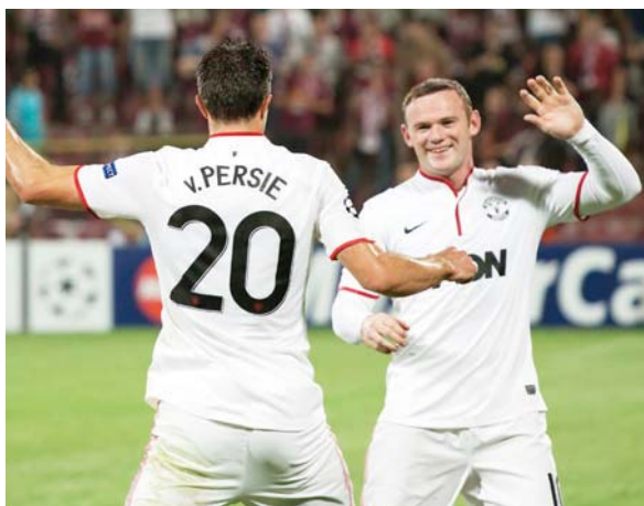
Man Utd generated a record operating profit of £117m in 2013/2014

Unsurprisingly, the record revenues and greater frugality meant Premier League clubs combined enjoyed a