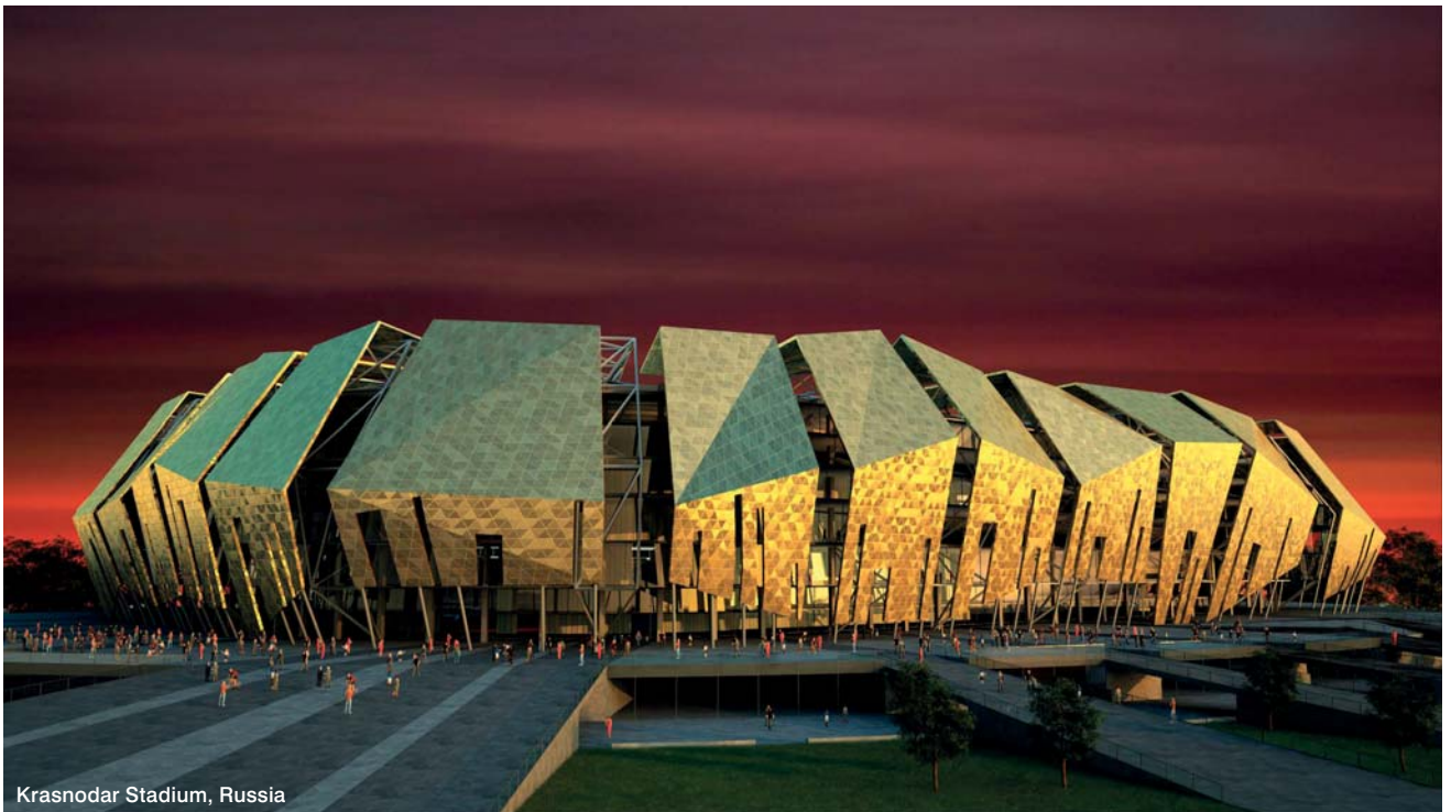
Krasnodar Stadium, Russia