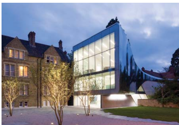
The £11m building spans two Victorian buildings of St Antony's College

The Middle East Centre holds Oxford University's collection on the modern Middle East, a world-class collection of