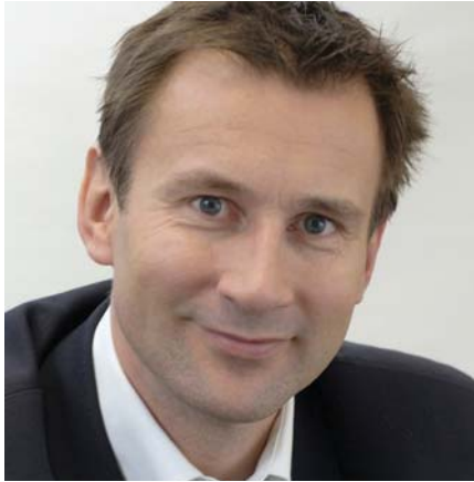
Jeremy Hunt outlined plans for a national strategy

Citing a recent editorial calling for an end to over-zealous clinical interventions by doctors, Franklin said efforts should instead focus on prevention by instilling physical activity as a key aspect of children's lives. "Funding needs to be invested at grassroots level within schools and communities – i.e. leisure and sports