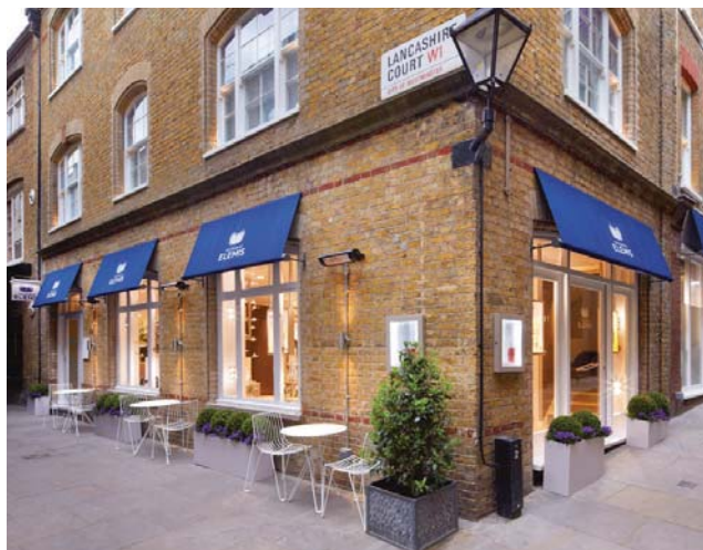
The House of Elemis includes an area dedicated to Biotec facials

The design brief for The House of Elemis was to reflect the brand pillars – 'the very best that science and nature can offer' – leading to natural materials being blended with textural lighting, artisanal glass, ceramic work and innovative design. With a view to increasing business three-fold, The House of Elemis incorporates a ground floor retail/sensory experience, plus a healthy food and juice offering; a Speed Spa section for men and women; an area dedicated to Biotec facials; and one of the most luxurious penthouse