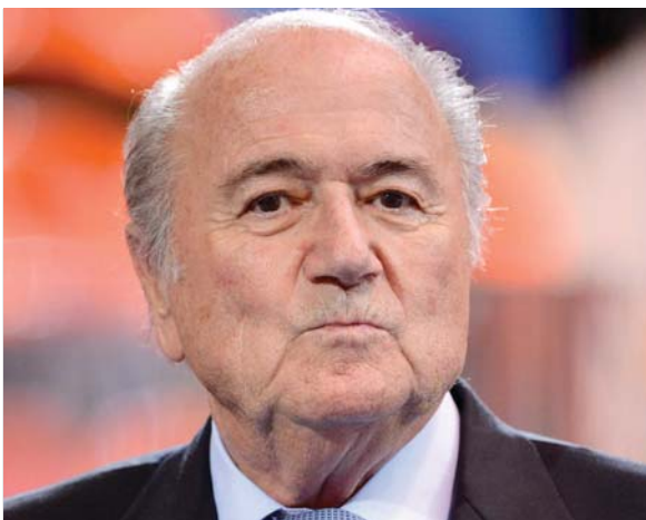
Sepp Blatter will step down as FIFA president after 17 years at the helm

Meanwhile, John Whittingdale, secretary of state for culture, media and sport, said this was the beginning of a reform process for FIFA. "Governments, national associations