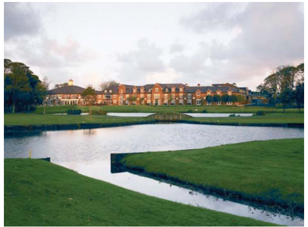
The golf operation includes an 18-hole parkland championship par course

"Formby Hall Golf Resort & Spa an exceptionally highly regarded resort with strong commercial appeal and the potential for considerable growth, particularly if the