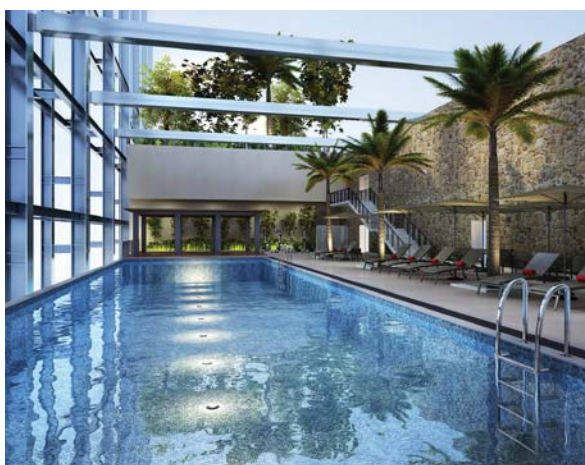
The Singapore site has a rooftop pool and a deck for al fresco workouts

The first Gravity health club will launch in Singapore in July, with ambitions of bringing a marquee site to London at a later date. The £4.7m gym will be located at the top of the new CapitaGreen Tower in the Singapore