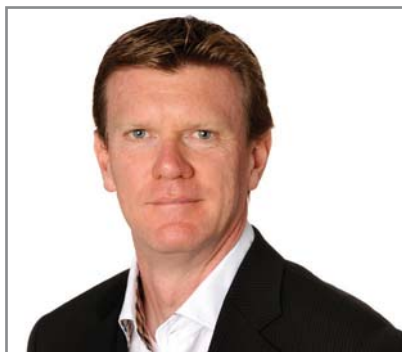
Earlam has an impressive leisure CV

According to the study, fast walking was the most popular form of exercise – being enjoyed by 38 per cent of respondents, followed in second and third place by swimming and cycling. Details: http://lei.sr?a=N3k9w