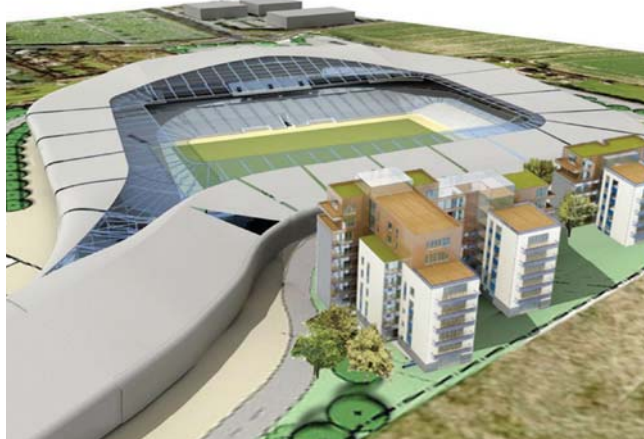
Populous are behind the plans, which have been in the works since 2006

The £80m Southend scheme, tentatively known as Fossetts Farm Stadium, has been laid out by architects Populous and includes a £25m 22,000-seat stadium, a 12-screen multiplex cinema, a hotel and retail park, and a 13-storey tower block comprised of 170 apartments. The futuristic-looking stadium will also be connected to a training ground and