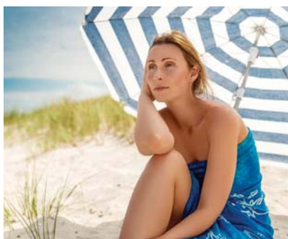
Prevention is key in guarding against skin cancer

The global survey's data, collected in 2014, maps out beauty regimes, product usage frequency and path-to-purchase factors by age group. 35 per cent of the respondents aged over-60 stated that they used anti-ageing products in the three months prior to the survey. Details: http://lei.sr?a=R2Z7q