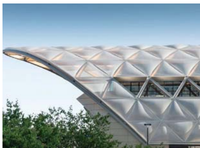
The facilities are enclosed by a timber lattice roof