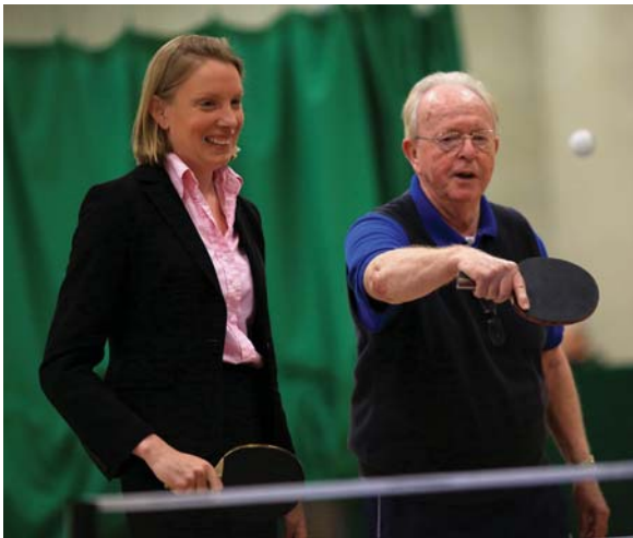
Sports minister Tracey Crouch on a visit to the Active Norfolk project

Inactivity costs the economy £7.4bn a year, according to Public Health England figures, while evidence shows that if adults are physically active, it helps to prevent or manage more than 20 chronic health conditions, including