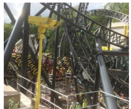
Injured riders were left dangling at a 45 degree angle