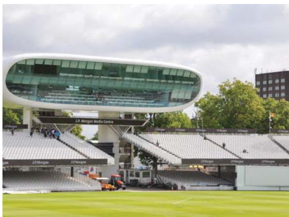
The media centre won the Stirling prize for architecture in 1999

Once complete, the centre will have 10 permanent TV and radio broadcast boxes – one less than at present but of increased