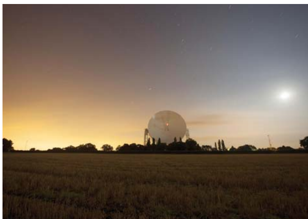
The funding at Jodrell Bank will help create a Lovell Telescope pavilion

Preservation of scientific and technological history is a running theme in this latest funding round, with one of the largest individual funds – worth £12.1m – going to Jodrell Bank in Cheshire, the home of the Lovell Telescope and the only site in the world