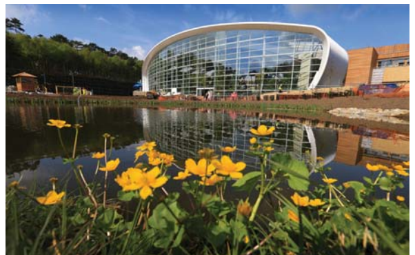
The latest Center Parcs resort – Woburn Forest – launched in June 2014

Brookfield, which specialises in property, renewable power and private equity, is amassing an enviable portfolio in the UK, having recently teamed with Qatar Investment Authority to buy London's Canary Wharf.