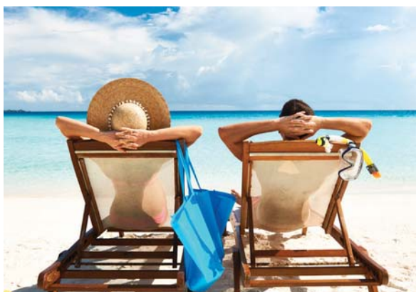
Increased spending by Britons abroad has contributed to the deficit

Overall, visitors to the UK typically spend more per trip than Brits travelling abroad, but there are far fewer of them. Around 73.9m overseas residents have visited the UK since the start of 2013, spending an average of £631. In