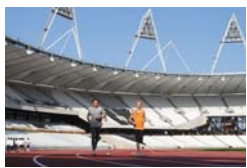
The Olympic Stadium's track has been laid down

Earlier this year, Hunt outlined the government's plans for the School Games competition, which is designed to help promote competitive sport to young people in "Olympic-style" tournaments.