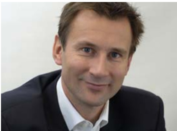
Hunt said he is in active talks with the industry over possible discounts

Working in partnership with tourism minister John Penrose, Hunt said the government will be looking to turn "strong interest into good business". Last month, Hunt announced that £3m from the Olympic budget had been