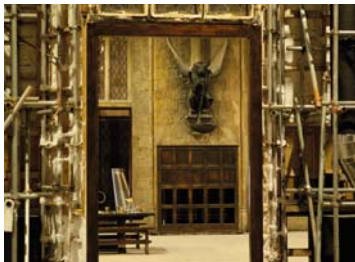
Tickets for the Harry Potter experience went on sale on 13 October

The new Harry Potter attraction has been designed by US-based exhibition design company Thinkwell and will cover more than 150,000sq ft (13,935sq m) at WB's studios in Leavesden, Hertfordshire.