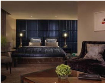
The Mercer Street Hotel has completed a £15m redevelopment

At the centre of the property is the Dial bar and restaurant concept, which offers pre-theatre dining and post-theatre drinking. Dial serves contemporary European cuisine using market-fresh UK produce, while the bar offers a mezze menu.