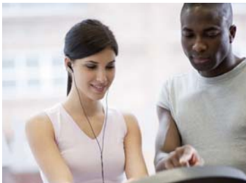
Active leisure has been given a grant of £900,000 towards training

Skills Active will also deliver projects designed to improve the access to specialist training and qualifications for workers in the playwork and fitness and leisure sectors. Meanwhile, People 1st will create a Hospitality Guild which will broker 500 new apprenticeship places, introduce four voluntary licence