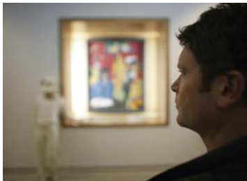
The scheme aims to increase the number of philanthropic donations

The £100m fund comprises three strands: the first being the £55m Catalyst: Endowments strand jointly funded by ACE, HLF and the Department for Culture, Media and Sport. Groups will be able to apply for an endowment worth between £500,000 and £5m, which will have to be at least matched through private giving. The Catalyst Arts: capacity building and match funding scheme will see £30m invested by