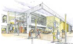
The centre was designed by Holder Mathias

The investment by NSC and Tone also included the conversion of an old gym into a multi-purpose studio and an upgrade of the swimming pool lighting.