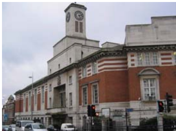
The baths will be closed as part of a large redevelopment of the area

S&P Architects are working with Ealing Council on the plans for the scheme, which will see a library; community spaces; and offices for the local authority also included.