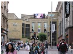
The Royal Concert Hall will undergo an overhaul

Theatr Colwyn's upstairs bar has now been relocated to the foyer, while a new box office has been created along with office space. Disabled access has also been improved at the town's arts venue.