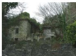
The Cardigan Castle in Ceredigion, Wales

As part of the refurbishment, late 20th century fittings and additions were stripped out uncovering original architectural features and revealing the splendour of the property's original Victorian spaces.