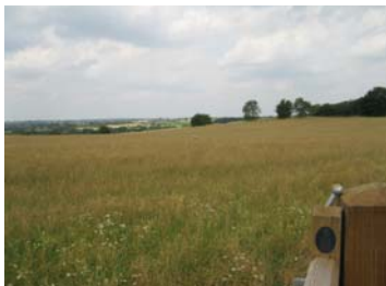
The trust is now looking to raise £3.3m to secure the Leicestershire site