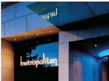
The recently launched Metropolitan now has a brand new luxury spa

The new spa also includes an expanded gym and yoga facilities, while the reception will have a dedicated retail space stocking Como Shambhala products. Treatments will include Dr Perricone, with the Metropolitan London