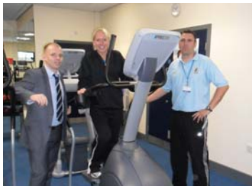
The facility's new dual-use health club was equipped by Precor

Working in partnership with the Parents and Teachers Organisation and the Youth Charter for Sport, Malbank School and Sixth Form College secured 50 per cent of the funding.