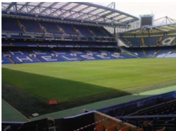
Stamford Bridge, Chelsea Football Club's current home in West London

It comes as CFC revealed that it is considering a move away from Stamford Bridge due to