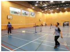
Badminton - one of the sports to secure funding

CCC was the lead funding partner in the development, contributing £17m, while further support was provided by Kent County Council and the regional development agency.