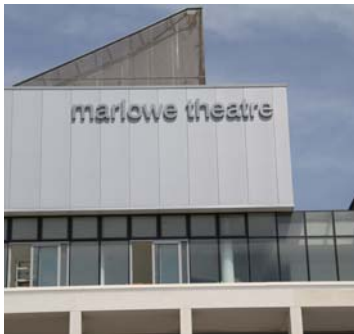
The new theatre occupies the site of a former building opened in the 1930s

Canterbury City Council (CCC) will manage and own the property, which is set to cater for a wide range of alternative, community and educational projects in the Marlowe Studio.