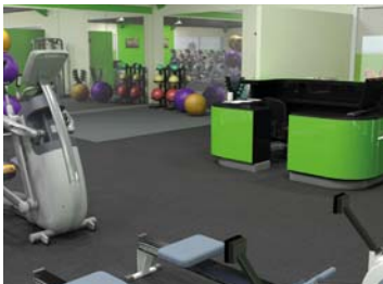
The Stockport club is the latest addition to the Fit4Less portfolio