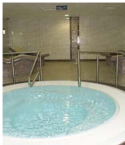
The spa area includes a relaxation area with pool

All treatments are based on the 'dosha' of each client, with all signature rituals and therapies lasting more than 90 minutes in duration to start with personally-tailored yoga stretches. Bovey Castle's Sundari Spa currently includes five treatment rooms; a relaxation room; and a salon, as well as a sauna, a steamroom, a whirlpool and a fitness suite equipped by Precor.