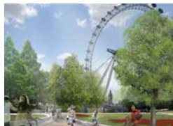
The South Bank gardens are set to be overhauled

The fund aims to "engage" communities in sustainability projects and it is hoped that the investment will encourage the development of more schemes.