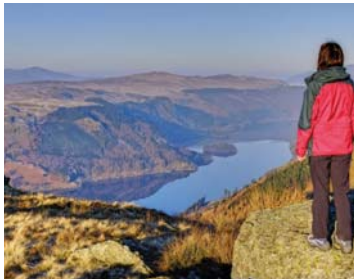
The Lake District is one of the two National Parks that will be expanded