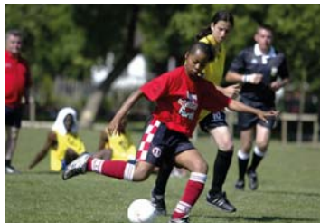
Concerns have been raised about the legacy plans for the 2012 Games