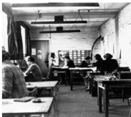
The grant will help tell the story of Bletchley Park

New exhibitions and interactive displays will be created to bring Bletchley's story alive - including educational activities centred around three themes: war, people and puzzles. The grant is dependent on Bletchley Park Trust raising £1.7m in match funding.