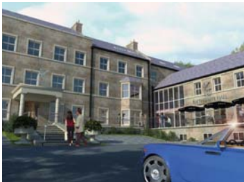
When open, the spa at the resort will include four treatment rooms

Aromatherapy Associates will offer a full range of treatments as part of the deal, which will include manicures, pedicures, massages