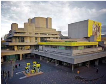
The theatre saw income increase by 9 per cent on the previous year

The surplus generated by War Horse has now gone towards the NT Future project, a planned £70m redevelopment which the organisation said is now at the detailed design stage.