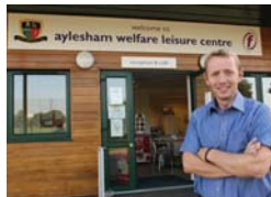
The new Aylesham centre includes a fitness suite

Work on the Faulkner Browns Architects-designed development is scheduled to be completed in September next year, with the council planning to keep the facility open amid work on the phased programme.