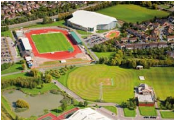
Plans for the site - which includes a velodrome - have been submitted

The project will include education space; WFT football development headquarters; and the provision of training facilities for international and professional teams visiting Wales.