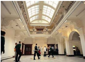
The gallery will be temporarily closed to allow the £6m redevelopment