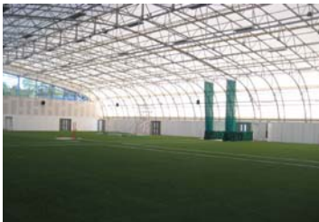
The £6.5m Parc Eirias centre of excellence will open its doors next month

A heavy weights gym; four changing rooms, one with a plunge bath; a physiotherapy room with three treatment couches; and 10 corporate boxes/meeting rooms are also on offer.