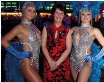
The venue offers a range of services and is Grosvenor's second in the area