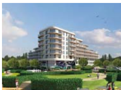
The Wave Hotel will be built as a modular property