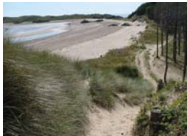
Newborough Forest is bordered by Llanddwyn Beach