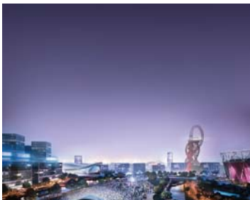
An indicative image of how the Olympic Park's southern area could look

Meanwhile, a second area to the north of the park will be located in the green river valley