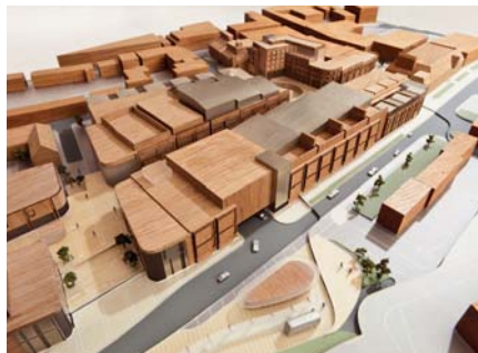
The development will comprise a hotel and a cinema