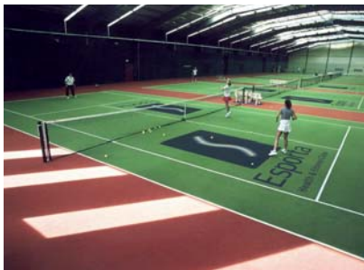
The £179m deal covers 17 locations across the UK