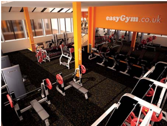
easyGym has just launched but is already looking towards future growth

Lorimer-Wing confirmed plans to unveil five easyGym clubs within the chain's first year of trading, with growth to accelerate to 6-10 new clubs a year "once the model is settled".