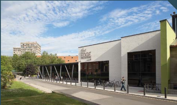
The Edge, University of Leeds

S&P works with you to deliver inspirational environments by solving your procurement demands and establishing new models of service consolidation and partnership working