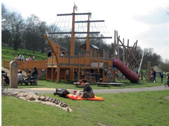
Nottingham Forest Recreation Ground secured joint HLF/BIG funding

The largest share of the HLF investment has been awarded to Victoria Park in St Helens to