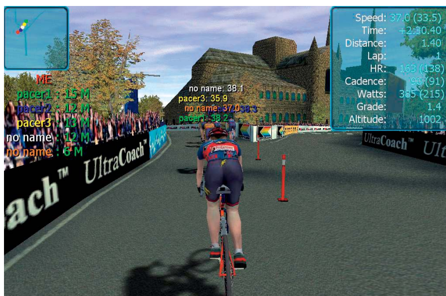
Cranlea and Instyle Fitness will set up a virtual biathlon competition at the LIW show floor – a world first

Group training in a virtual world gets personal and adds a great competitive edge to your training experience. In a world first, Cranlea and Instyle Fitness have set up a virtual biathlon competition exclusively at LIW.