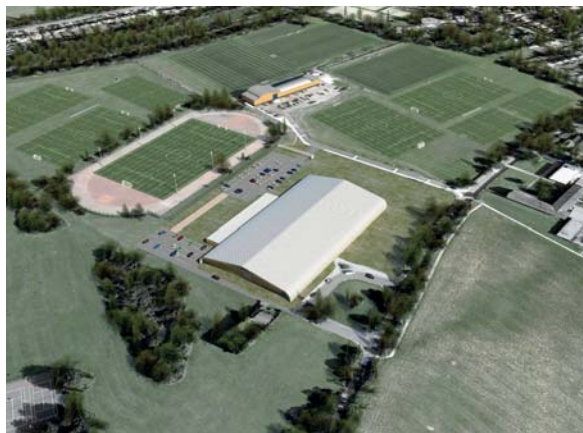
WWFC is to build the venue on the site of St Edmund's Catholic School

WWFC will develop the site after the school relocates to a vacated building at Compton