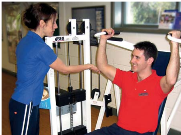
The programme will include a six-month placement at a leisure centre