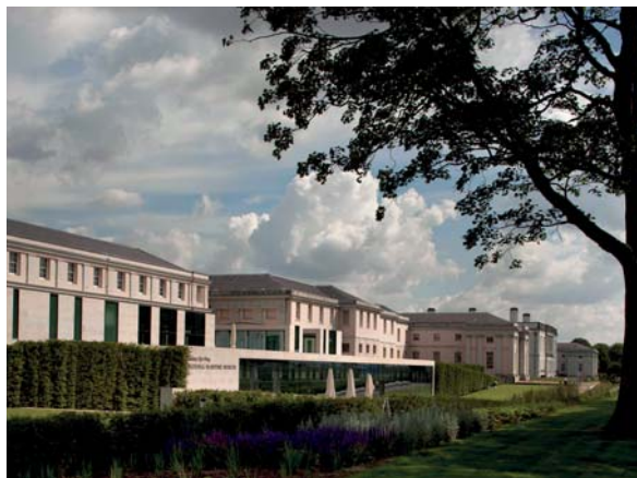
The new Sammy Ofer Wing is the largest development in NMM's history

Meanwhile, a restaurant and a café overlooking Greenwich Park; a library and archive; and a new entrance from Greenwich Park also form part of the development.