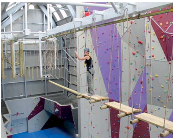
A high ropes course 12m (39ft) above the ground is among the facilities

Facilities include a Skate and BMX park with one of the only indoor concrete pool and bowl complexes in the UK; a 60m x 14m (197ft x 46ft) climbing wall with four individual areas for all abilities; and a 206sq m (2,217sq ft) bouldering facility. XC – run by DST – also features an indoor caving system and a high ropes obstacle course.