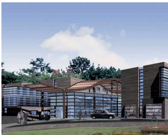
It is hoped that the new hotel will attain an 'Excellent' BREEAM rating

It is anticipated that the new property will secure an Excellent rating under the Building Research Establishment Environmental Assessment Method (BREEAM).