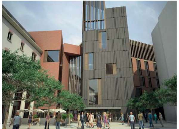
The six-storey venue will incorporate two black box performance spaces

Speaking on a visit to the venue, Ní Chuilín said: "The MAC will also provide an artistic