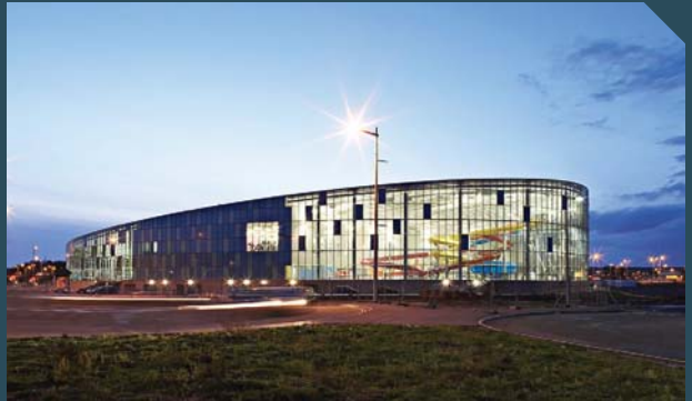
Cardiff International Pool