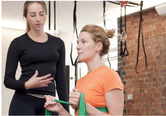
The programme is fully accredited by the American Council on Exercise