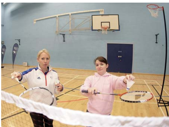
The £50m fund aims to help up to 1,000 clubs upgrade ageing facilities

Examples of how investment might be directed include the installation of a sprung floor that will convert an unused hall into a multi-sport facility. New changing rooms and new floodlights are also among improvements