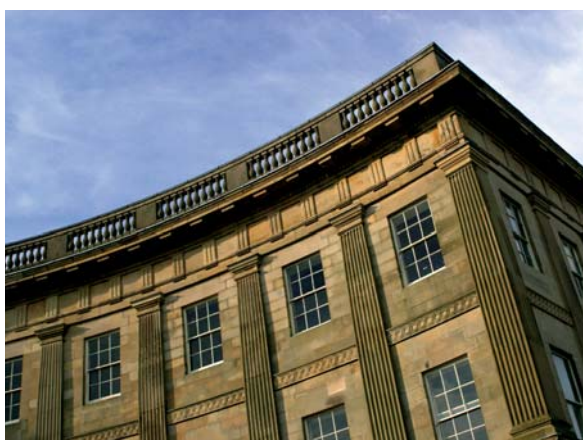
The funding will go towards the historic venue's £35m transformation

Trevor Osborne Property Group, CP Holdings and Danubius Hotels are currently working on the scheme in partnership with High Peak Borough Council (HPBC). Derbyshire County Council is also involved with the development and is providing funding