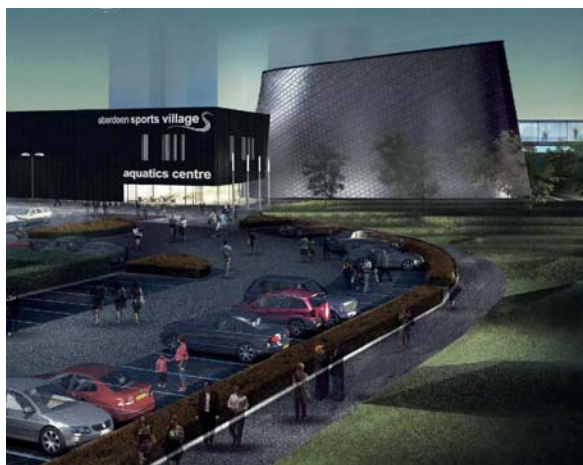
FaulknerBrowns Architects are behind the design of the £18.2m venue

A 25m x 16.5m diving pool, with water cushioning systems and an adjustable floor is also planned, along with a timing and video analysis lab. Davis Langdon has been appointed to project manage the scheme, which builds on the success of the £28m regional sports centre opened in 2009.