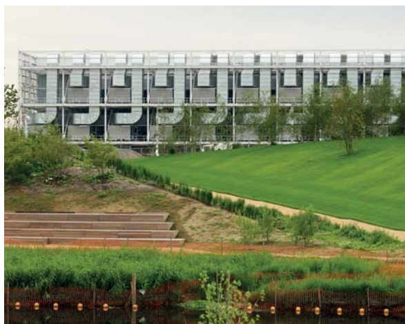
The new 275m-long IBC is the fifth Olympic Park venue to be finished