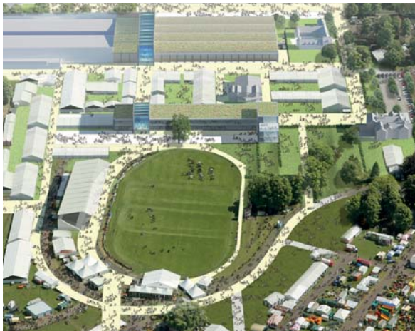
A revamp of the Royal Highland Centre forms part of the overall plans

of around £250m a year. The International Business Gateway will be built on land between the airport and the RBS headquarters, with the potential for a multi-use venue/arena.