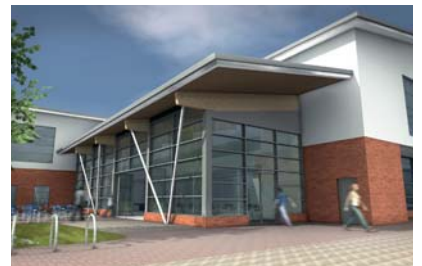
Work could start on the facility "within months"

The centre will be closed for 18 months from mid-2012 while work on the multi-million pound renovation takes place.