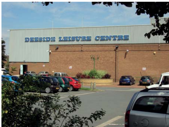
The second stage of improvements are soon to be opened at the venue

A third phase is also being undertaken, which will transform the old ice rink into an