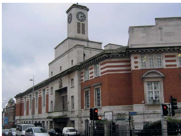
Acton Town Hall will be transformed into a multi-purpose leisure venue