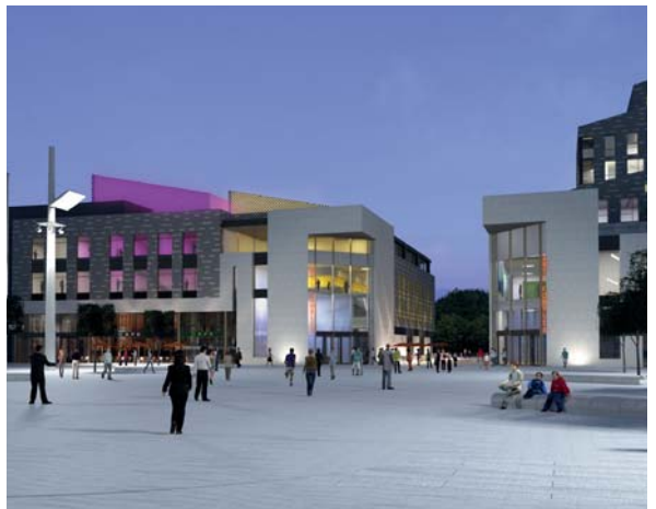
The arts complex will be at the heart of Southampton's Cultural Quarter

The proposed new facility is set to include auditoria; studio and creation space for the performing arts; and film and media facilities; as well as a contemporary gallery.