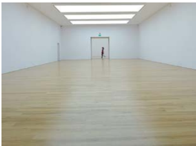
Six new contemporary galleries are now on offer