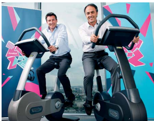
Technogym will be the Official Fitness Supplier to London 2012 Games

LIW will showcase a special London 2012 Team GB-Paralympic GB area and participating clubs will be able to win equipment from the Olympic Village gym. REPS accredited trainers will be able to enter a competition to win a place as a trainer in the Olympic Village Gym for the Olympics and Paralympics.