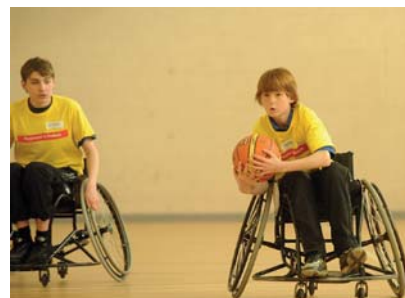
The new funding will help increase participation

Leisure and travel will be among the biggest winners, with the hotel industry expected to see a £122.6m uplift and the entertainment and food sector receiving a £81.5m boost.