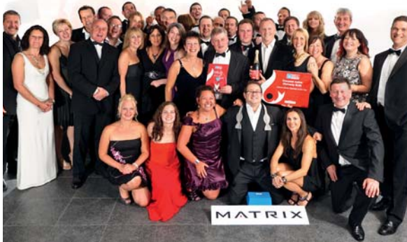
Everyone Active was crowned Leisure Centre Operator of the Year 2011

Lichfield Golf and Country Club was unveiled as Club of the Year (more than 4,000 members) and Rainbow Leisure Centre is the 2011 Centre of the Year. Other winners were Ethos Sports Centre, Sport Imperial (Educational Club of the Year); Nuffield Health RBS Fitness and Wellbeing Centre (Corporate