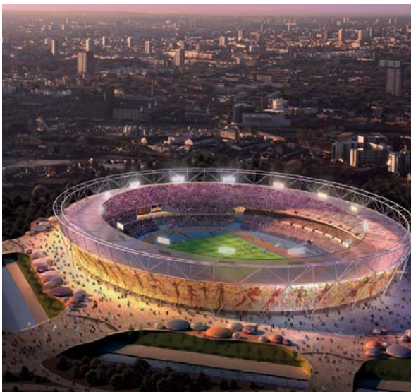
Leisure and travel sectors are to be among the winners from the Games

Longer-term impacts of the event will see an additional £1.37bn worth of economic output per year and nearly 18,000 additional jobs per year, along with anticipated growth of 3.5 per cent.