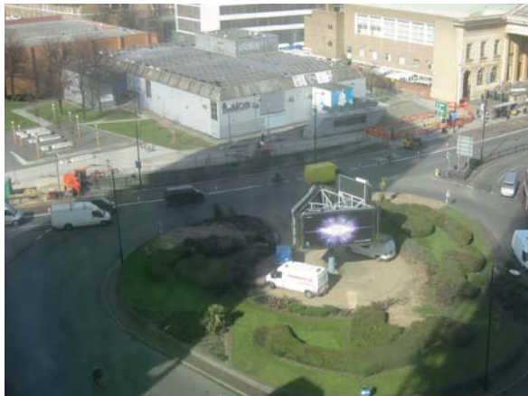
The existing leisure centre site (centre top) is in line for redevelopment

Meanwhile, Squire and Partners has been chosen to design a residential project that is set to occupy the front of the current leisure centre site, fronting St Mary's Churchyard Park.