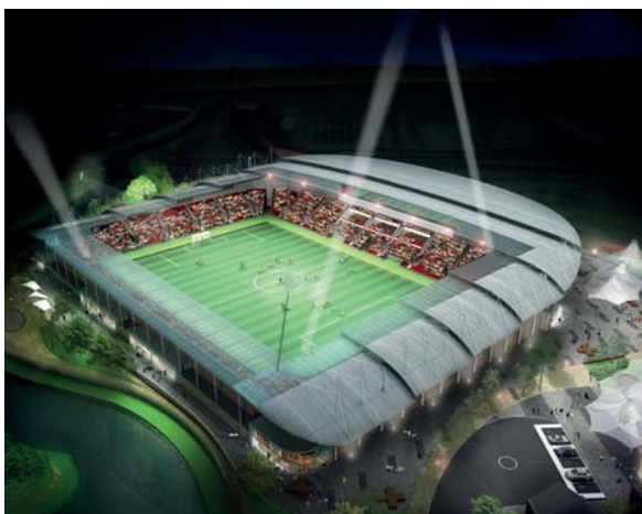
S&P Architects designed Rotherham United's new 12,000-seat stadium

Gleeds is project managing the scheme, which will see the north and south stands to boast a polycarbonate edge to the roof to enable light to reach the pitch. The east stand is also to comprise a polycarbonate roof system as part of the stadium, which is scheduled to open ahead of the 2012-13 season.