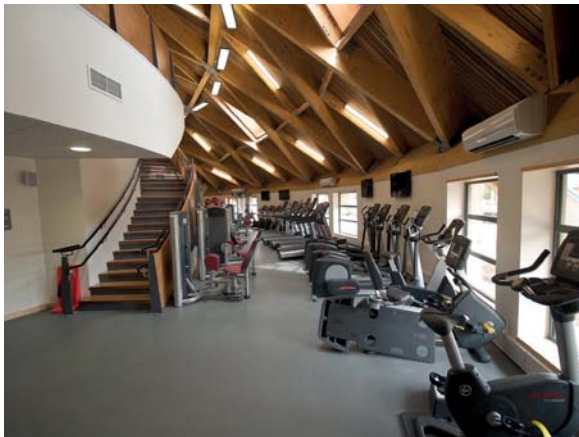
A split-level, 85-station Life Fitness gym is set to occupy one of the pods

The Pods will boast a large split-level, 85-station Life Fitness gym occupying one pod, with two of the largest domes housing the double pool, spectator area and six-court sports hall. Two exercise studios and a further fitness area;