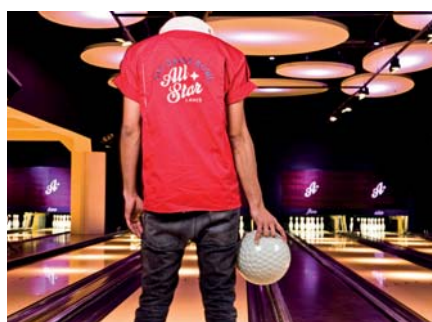
All Star Lanes will launch a 14-lane alley in Stratford

"From a wider perspective we view this an opportunity to launch our brand to a new