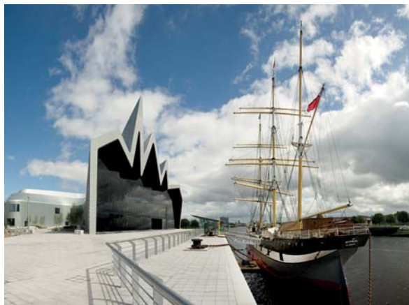
Zaha Hadid designed the landmark new riverside museum for Glasgow

BAM Construction started construction work on site in 2007, with the interiors and theming company, Mivan, appointed to deliver the fit-out of the new Riverside Museum.