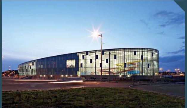
Cardiff International Pool