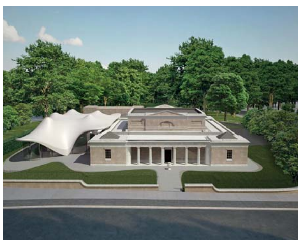
Zaha Hadid has been appointed to design and create the new attraction

The project was made possible by The Dr Mortimer and Theresa Sackler Foundation, which gave the largest single gift the Serpentine Gallery it has received in its 40 year history.