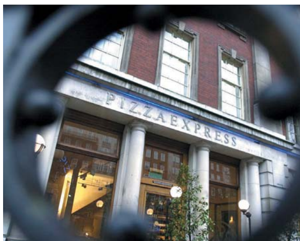
Pizza Express will enable guests to pay for dinner using their iPhones

The free-to-download application accepts both PayPal and credit card methods of payment. Once a payment has been processed, the restaurant's point of sale system is notified that the bill has been