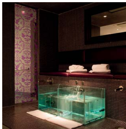
It is No.1 Traveller's latest 'super-lounge' to open