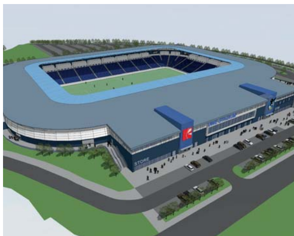
Work will start on the venue in early 2012 subject to planning consent

A crèche; a gym; a jogging track; and around 19,000sq ft (1,765sq m) of potential teaching space for UWE are also proposed.