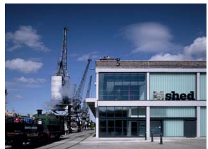
BAM Construction built Bristol's new attraction