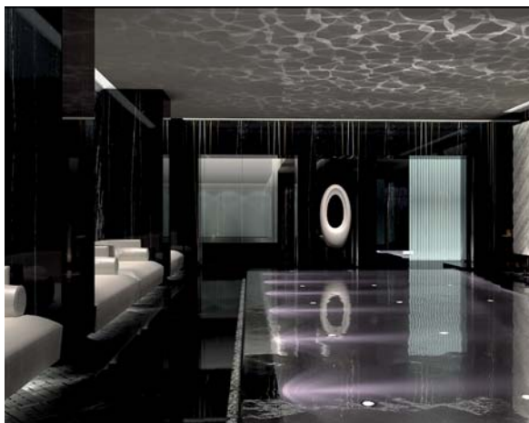
The new facility is seen as a "leading voice in the next generation of spa"

ESPA Life has been designed by GA Design and boasts 15 treatment 'pods', a private spa suite, a thermal floor, a spa lounge serving healthy food and a gym. The thermal floor,