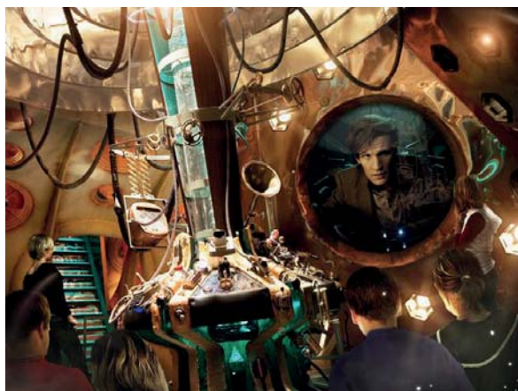
Cardiff is hoping to become the new permanent home of the attraction

The attraction will continue the city's strong link with Doctor Who. Cardiff has featured heavily in the storyline of a recent Doctor Who TV series and the Doctor Who Exhibition