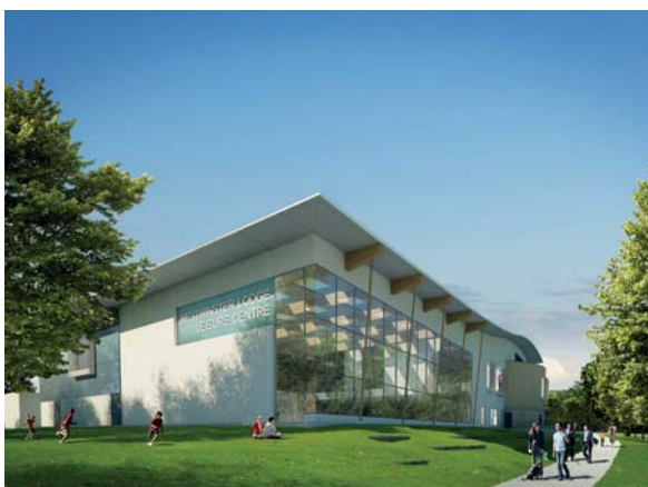
The proposed eight-lane swimming pool is to be extended to ten lanes

The council has now agreed savings with Willmott Dixon to provide extra capacity - adding an extra 100sq m (1,076sq ft) of pool space. However, alterations means that there will be insufficient space for the poolside