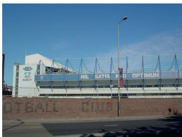
Everton Football Club's official charity is to establish a new Free School