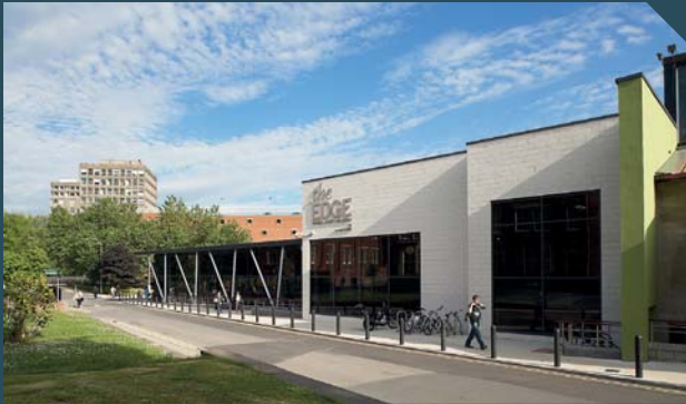
The Edge, University of Leeds

S&P works with you to deliver inspirational environments by solving your procurement demands and establishing new models of service consolidation and partnership working