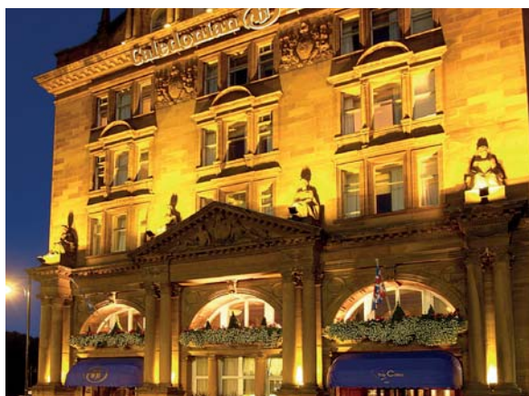
The Edinburgh property is to be converted into a Waldorf Astoria hotel