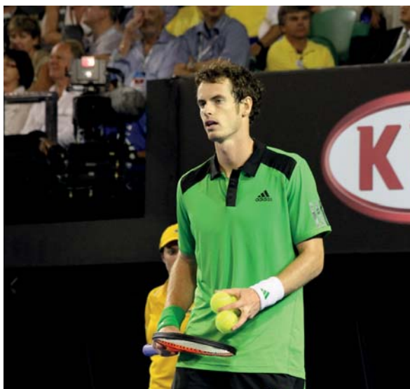
Andy Murray, along with brother Jamie, will be a Set4Sport ambassador

The new initiative has been inspired by the games that Judy played with Andy and Jamie is designed to support communities. Nationwide roadshows led by Judy are being planned for throughout the summer holidays, which will take the Set4Sport initiative into major cities. Meanwhile, both Andy and Jamie will act as ambassadors for the scheme and will boast the logo on their tennis match kits.