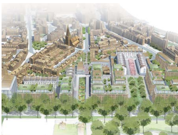
A sports centre and a boutique hotel are among Qatari Diar's proposals