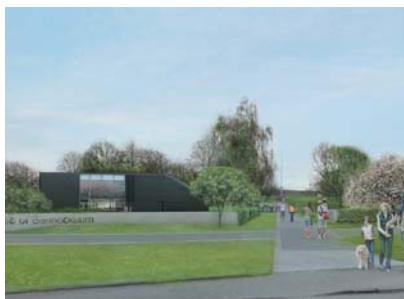
Reiach and Hall designed the planned new centre

In addition to the new purpose-built visitor centre, town wall walks are to be opened up and the presentation and interpretation of the property improved.