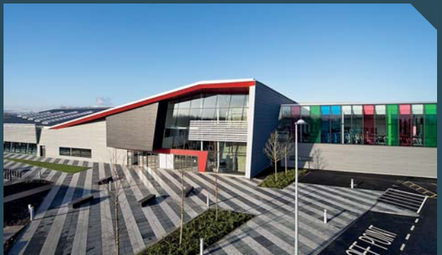
The Peak, Stirling Sports Village

DELIVERING INTELLIGENT SOLUTIONS FOR 30 YEARS