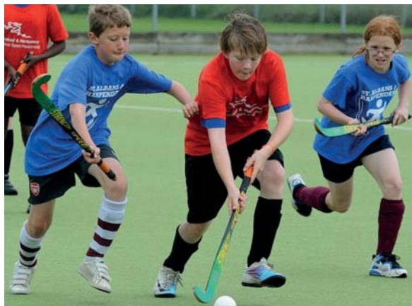
The government aims to 'revive' competitive school sports in the UK

The new action plan also aims to increase the number of sports currently on offer for