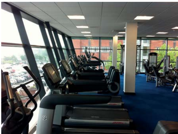
The new £12m complex is to incorporate the group's largest Amida Spa

Meanwhile, the Life Fitness Virtual Trainer programme – an online facility that allows gym