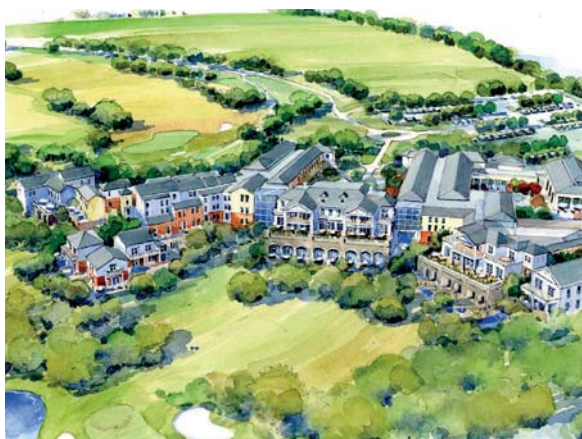
MacKenzie Wheeler are behind the designs of the hotel and spa scheme

The 130-room hotel will feature junior suites; butler-service suites; and a presidential suite,