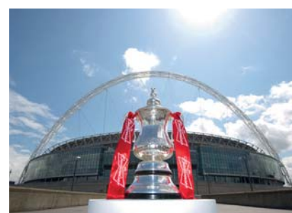
Budweiser secured a three-year deal with the FA

The design incorporates metallic outer shells and cedar-lined interiors, which are to form towers and overhangs to filter natural light into the building when complete.