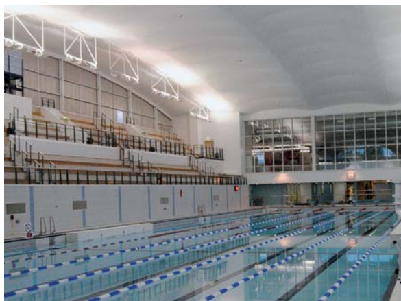
Dollan Aqua Centre houses one of Scotland's five Olympic-sized pools

Among the facilities at Dollan Aqua Centre is one of Scotland's five 50m competition pools and a health suite comprising a sauna, a steamroom, a sanarium and a spa bath. A gym equipped with Life Fitness cv machines and HUR resistance equipment; and a dance studio are also on offer.