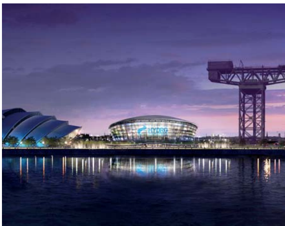
The Hydro is to stage 140 events and attract 1 million people each year

The Hydro is poised to become one of the world's busiest arenas and generate £131m for the local economy. SECC has secured the sponsorship deal with Scottish Hydro with the help of the operator and owner of some of the world's leading venues, AEG Worldwide.