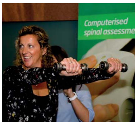
Sally Gunnell officially opened the Nuffield complex

Among the facilities in the fitness element is a health club featuring a 49-station cv area (21 treadmills, 14 bikes, 14 cross trainers); a free weights zone, resistance kit and the TRX system – as well as a vibration exercise unit.