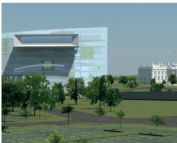
A 500-bedroom hotel with resort-style casino forms part of the scheme

An all-weather racecourse with a National Hunt track and sprint track is also among plans, although consent for a 15,000-seat arena was rejected by the planning authority.