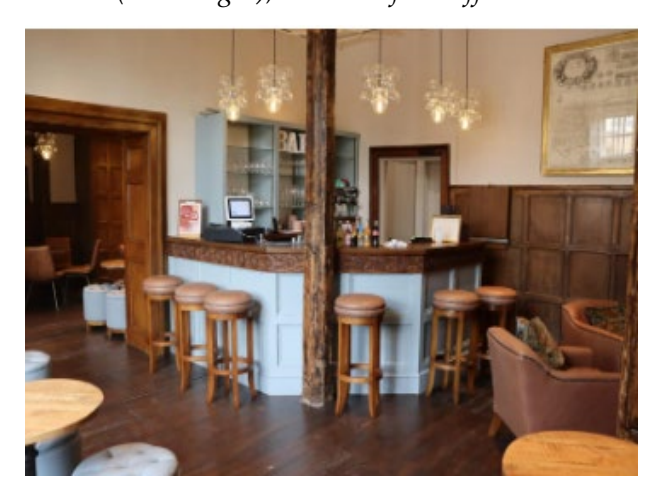
Denford Bar & Lounge (above), available for staff use